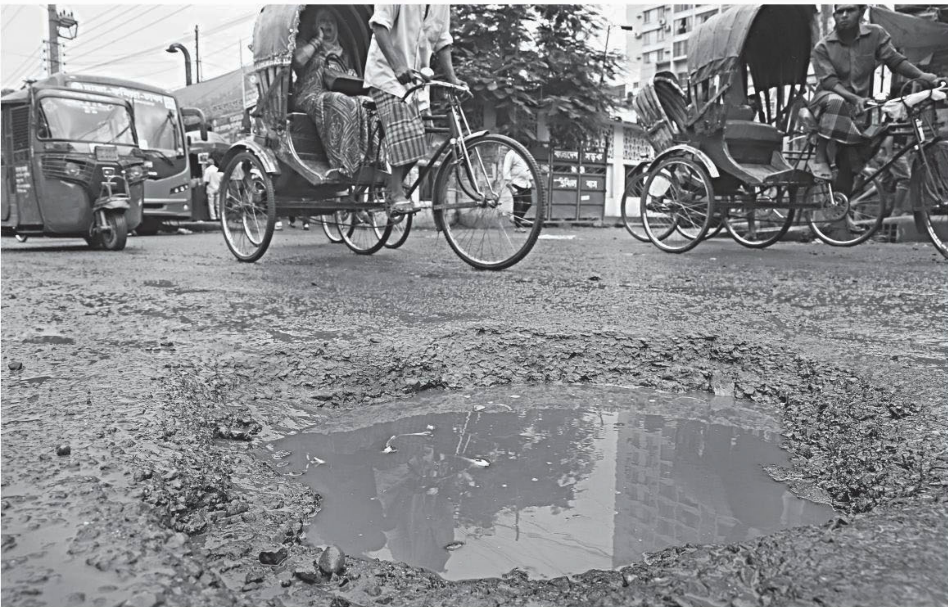
Large potholes at places and muddy surface have made travelling on this road in front of Kamalapur BRTC bus depot a risky and challenging task. Buses leaving or arriving at the depot are often seen facing difficulties negotiating this stretch. The situation worsens when it rains. The photo was taken yesterday.