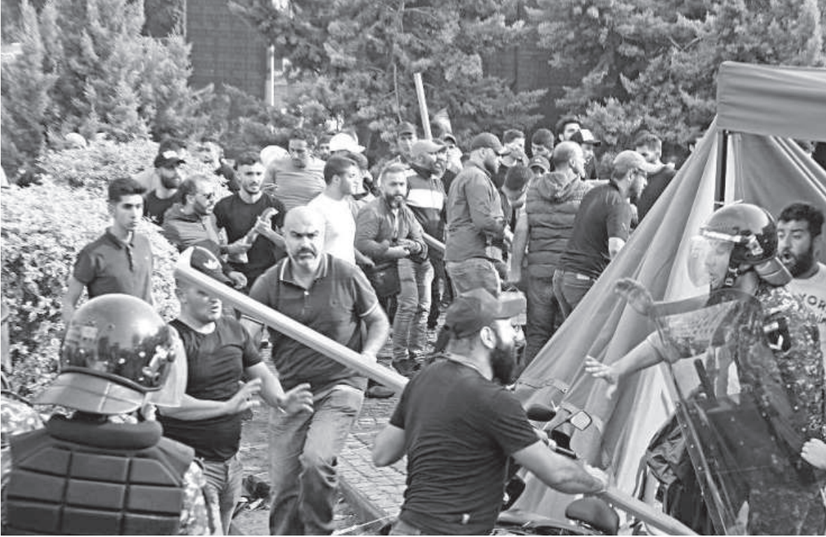
Riot police stand guard next to Hezbollah supporters during ongoing anti-government protests in downtown Beirut, Lebanon, yesterday. Hezbollah leader Sayyed Hassan Nasrallah yesterday urged his group's supporters to stay away from nationwide protests aimed at ousting the country's ruling elite. In a televised speech Nasrallah said Lebanon was being "targeted" internationally and regionally, and he expressed fear that someone was looking to plunge the country into civil war.

"But what can you do if prices shot up at the source of supply? If prices of onions rise in India, the prices go up here too," he added.