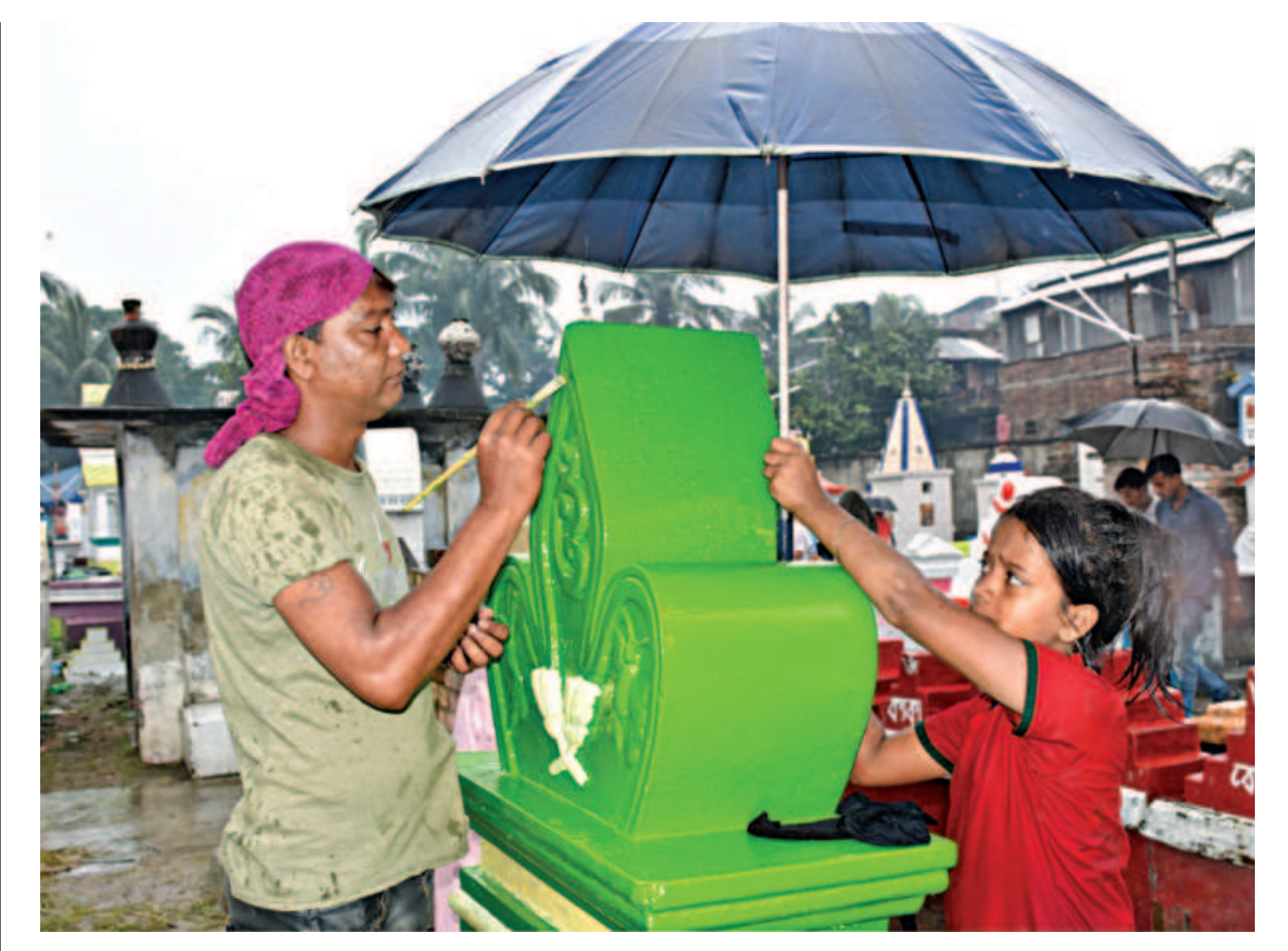
With his daughter holding an umbrella, a man paints the "Samadhi" (funerary monument) of a family member at Mohashashan in Barisal city yesterday. Hindus will observe the "Shashan Dipali" today. During the event, they offer special prayers for salvation of the departed souls of their near and dear ones. For more than a century, the community has been observing the programme at the cremation ground where a large number of people from home and abroad gather.

Chamber of Commerce and Industry has arranged 20 buses for admission seekers to commute for free. Bikers Community of Sylhet and other organisations have also arranged free commuting