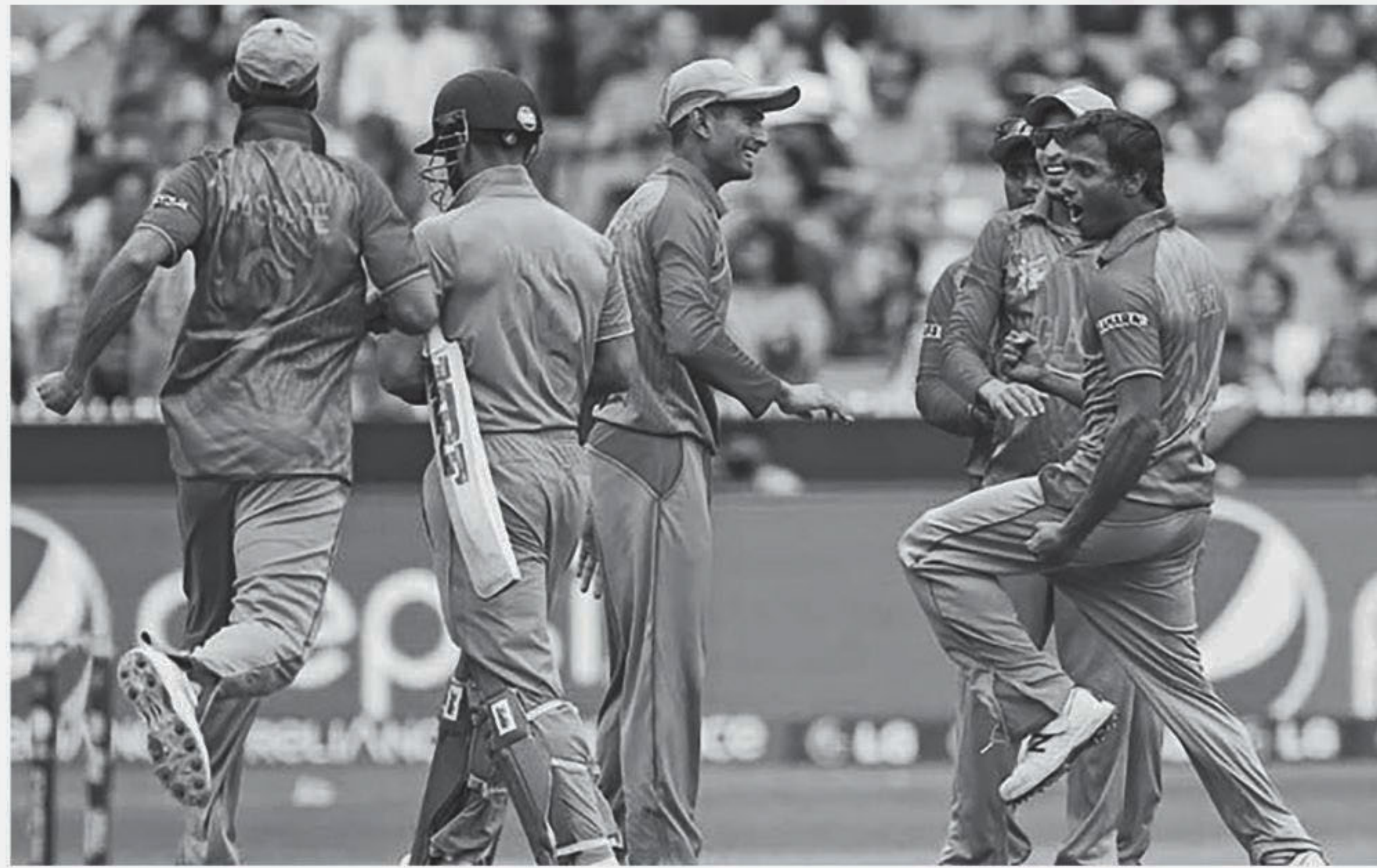
Bangladesh cricketers celebrate after sending Virat Kohli back to the dressing room during a Bangladesh-India cricket match.

With Eden Gardens, all eyes are also on Sourav Ganguly's grand entrance into the powerful officialdom of Indian cricket akin to his getting off a chopper in style at Purbachal Future City. BCB is rightfully optimistic that it can reap