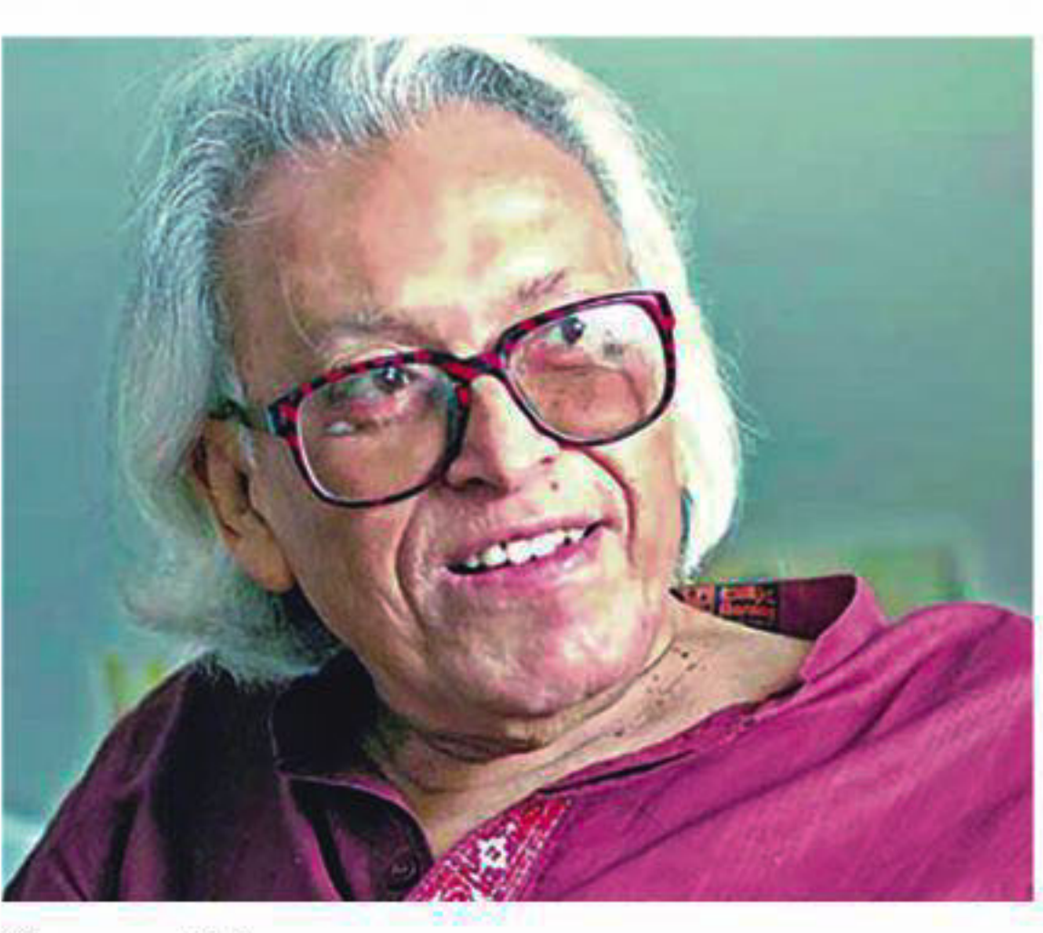
Shamsur Rahman