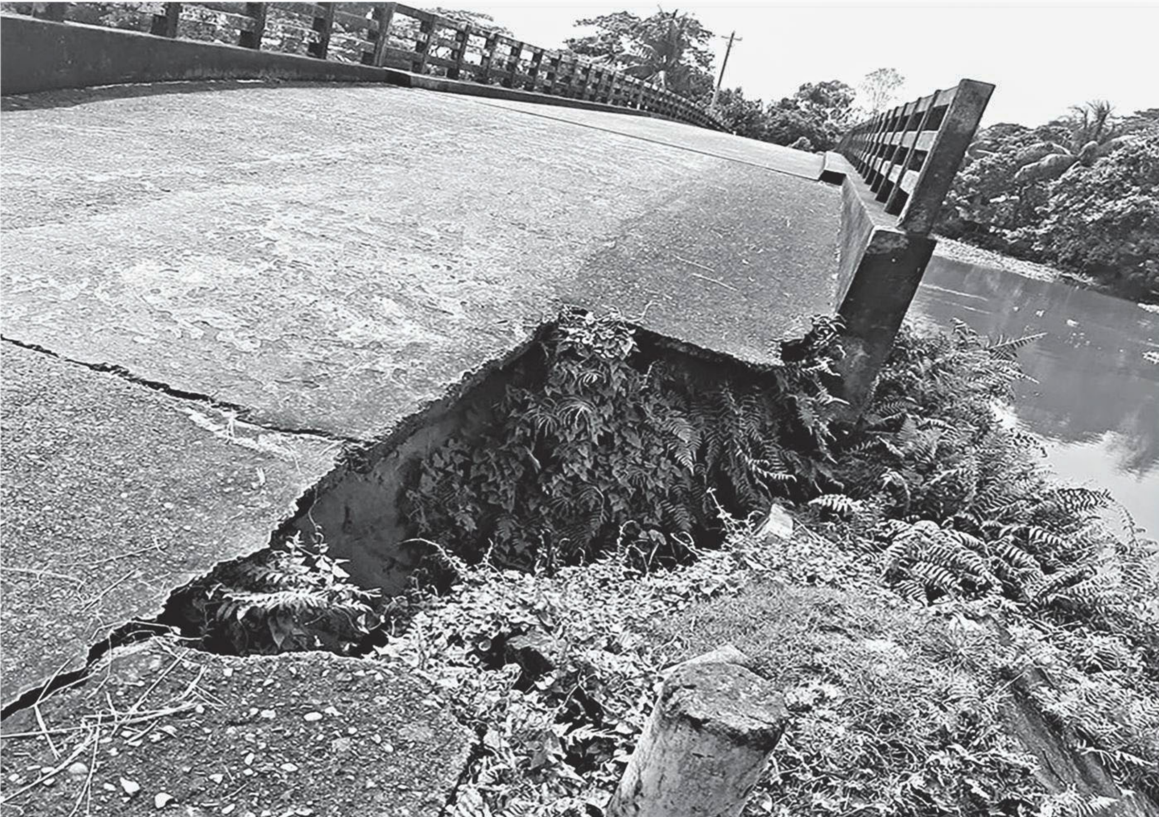
This section of the approach road to Barkhapon bridge on the Gonai river in Netrakona's Kalmakanda sustained damage more than a year ago. The authorities concerned are yet to repair it. The photo was taken recently.