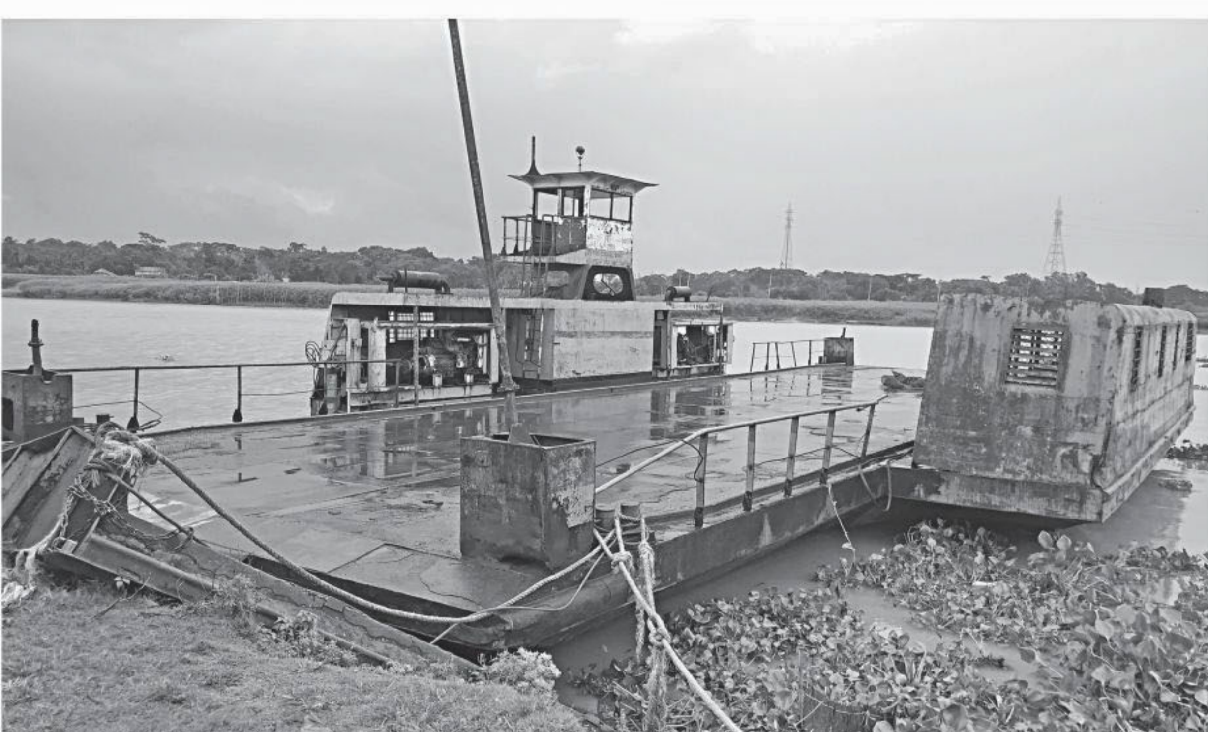
This ferry at Kazirtak terminal in Madaripur Sadar upazila is decaying as it has remained unused since a bridge was built on the Arial Kha river over four years ago. Three pontoons at the terminal are also rotting due to the same reason, thanks to the callousness of the authorities concerned.