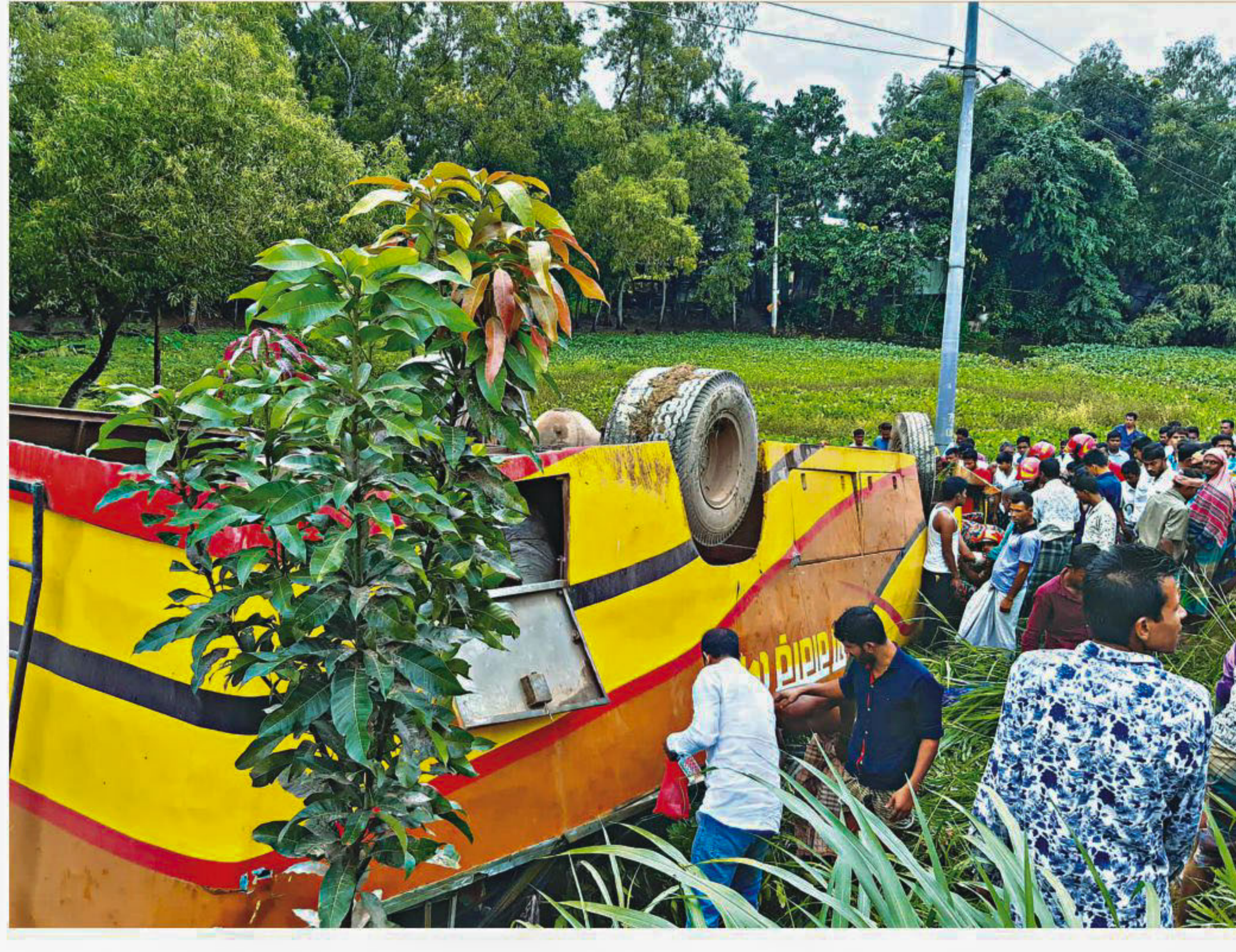
Locals and firemen try to rescue survivors from a wreckage of a bus. The bus was heading towards Tangail from Mymensingh, when it fell into a ditch after colliding with a truck at Tangail's Kalihati yesterday. At least 15 were hurt, four of them seriously, in the crash.