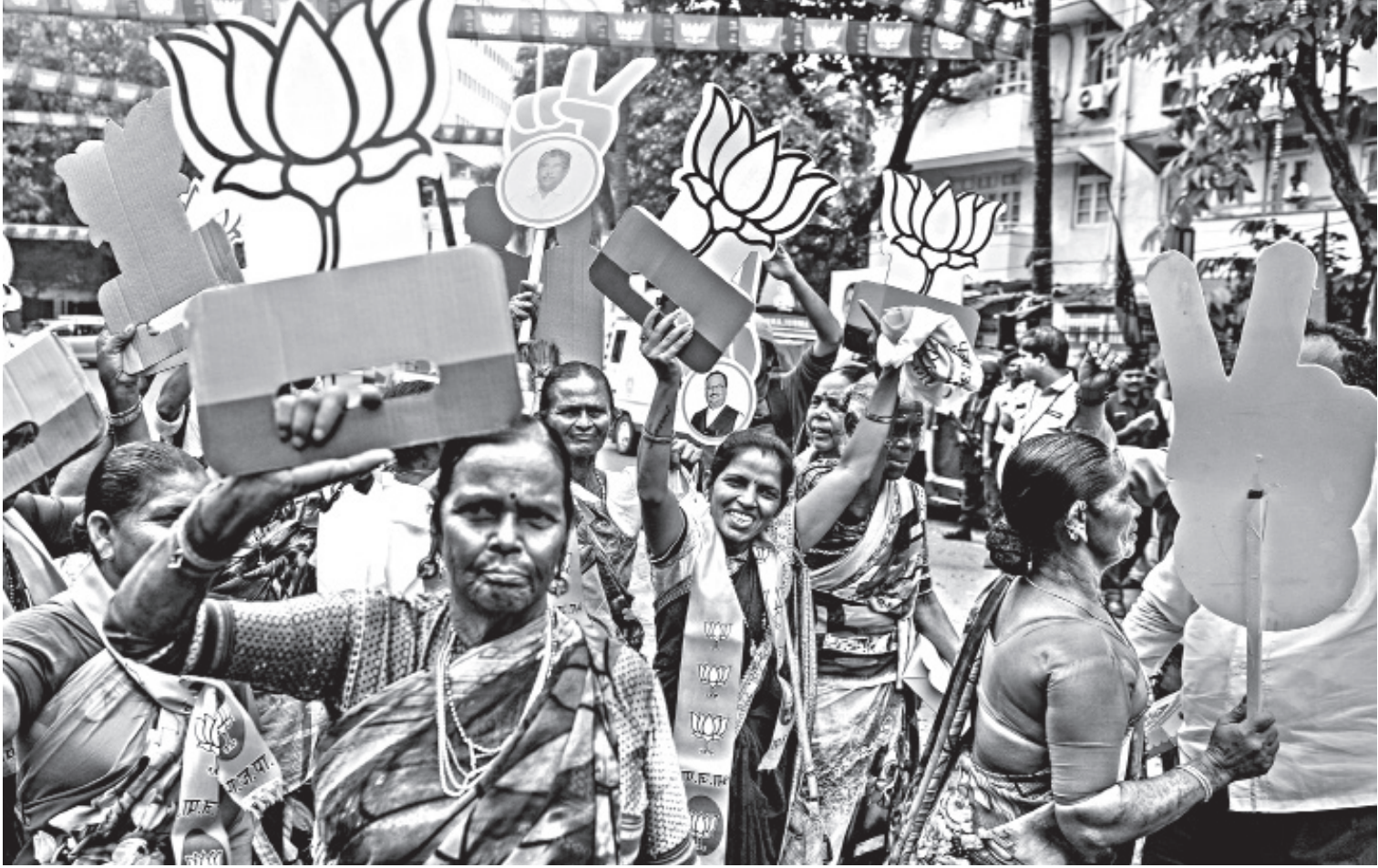
Supporters of India’s Prime Minister Narendra Modi and his ruling Bharatiya Janata Party (BJP) celebrate outside the party office after learning of initial assembly polls results in Mumbai, India, yesterday. BJP was set to retain power in Maharashtra and was leading in Haryana in the north, although the races turned out to be closer than forecast.

Nine people have been killed in southern Mexico in a shootout between two groups using high-powered weapons, authorities said yesterday. Several organized crime groups dedicated to trafficking drugs operate in the area and often clash over control of supply routes. The confrontation occurred Wednesday on a highway in a rural area in the state of Guerrero, the local attorney’s office said.