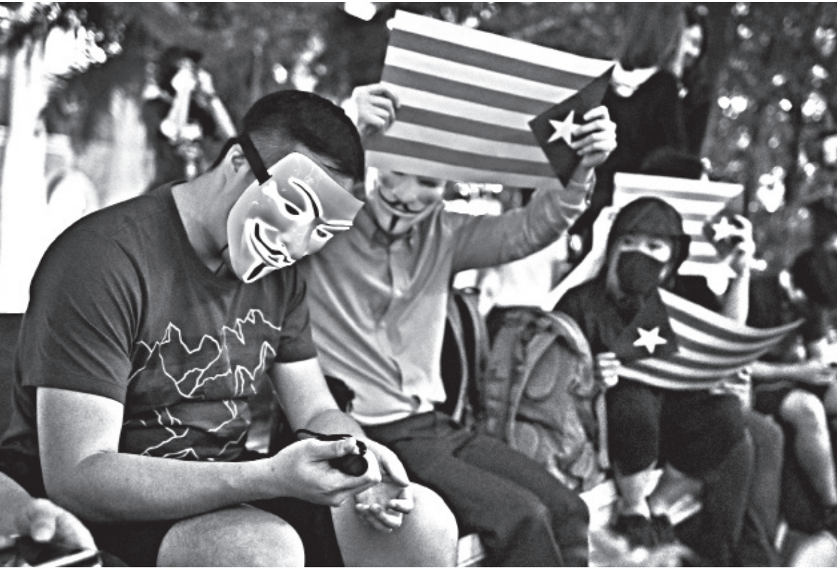
Masked protesters hold Catalan pro-independence “Estelada” flags during the Hong Kong-Catalonia solidarity assembly in Central district in Hong Kong yesterday.

“We want the centre to start the process of regularisation of unauthorised colonies immediately; there should be no further delay,” Kejriwal said.