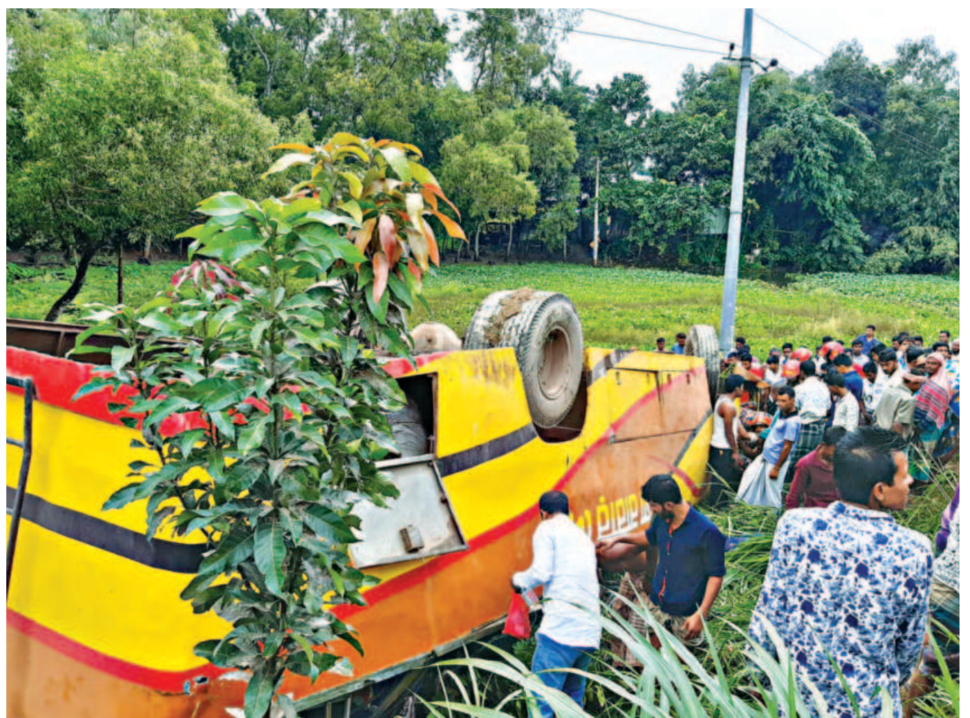
Locals and firemen try to rescue survivors from a wreckage of a bus. The bus was heading towards Tangail from Mymensingh, when it fell into a ditch after colliding with a truck at Tangail's Kalihati yesterday. At least 15 were hurt, four of them seriously, in the crash.