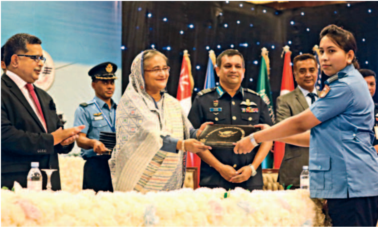
Prime Minister Sheikh Hasina hands over certificate to a participant of the 6th International Flight Safety Seminar at Pan Pacific Sonargaon Hotel yesterday.