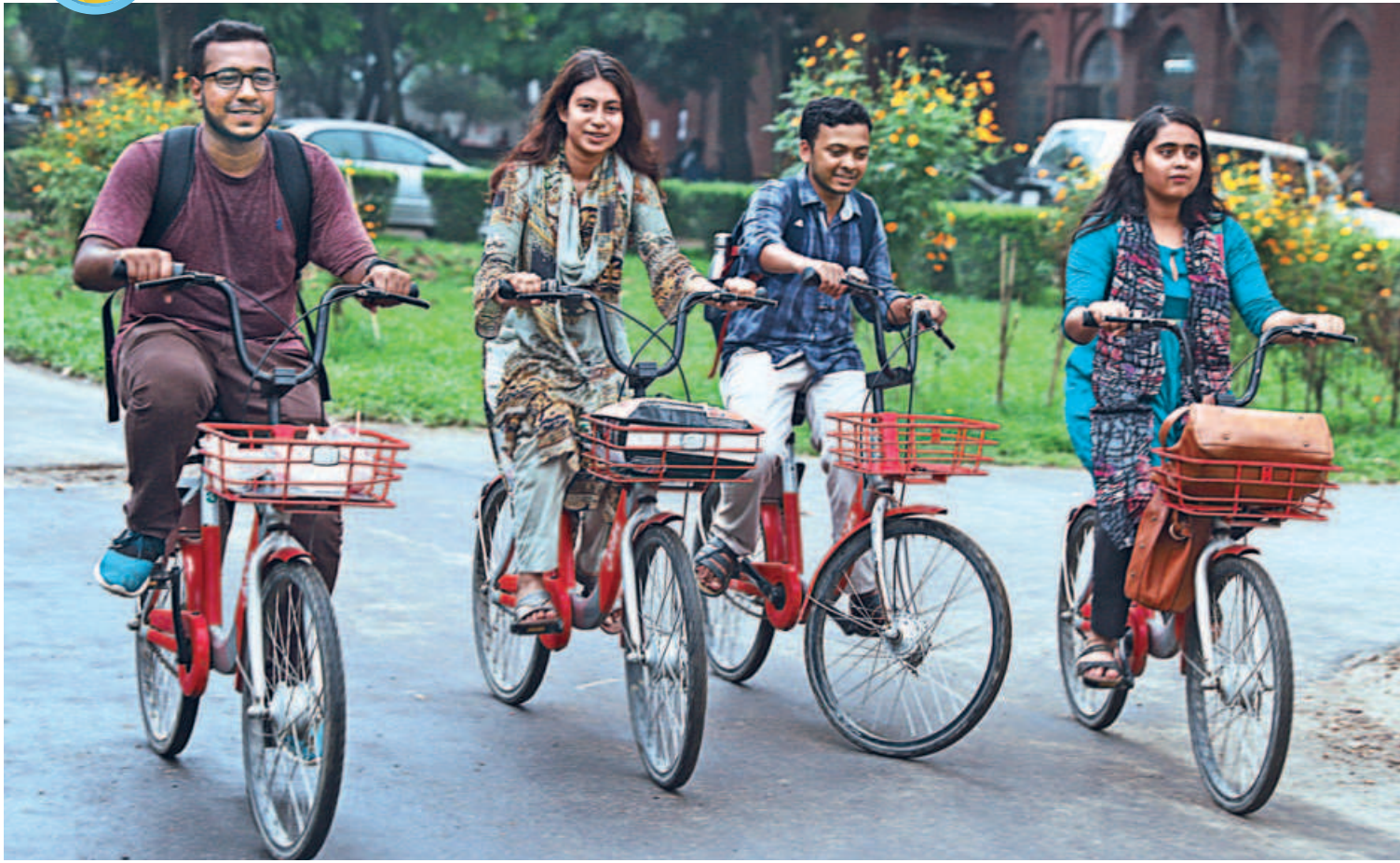
Dhaka University students enjoy a leisurely bicycle ride at Curzon Hall using JoBike, an app-based bike-rental service that was launched on the campus last week. The service is available to university students, teachers and staff at low cost through smartphones, and can be used only within the university premises.