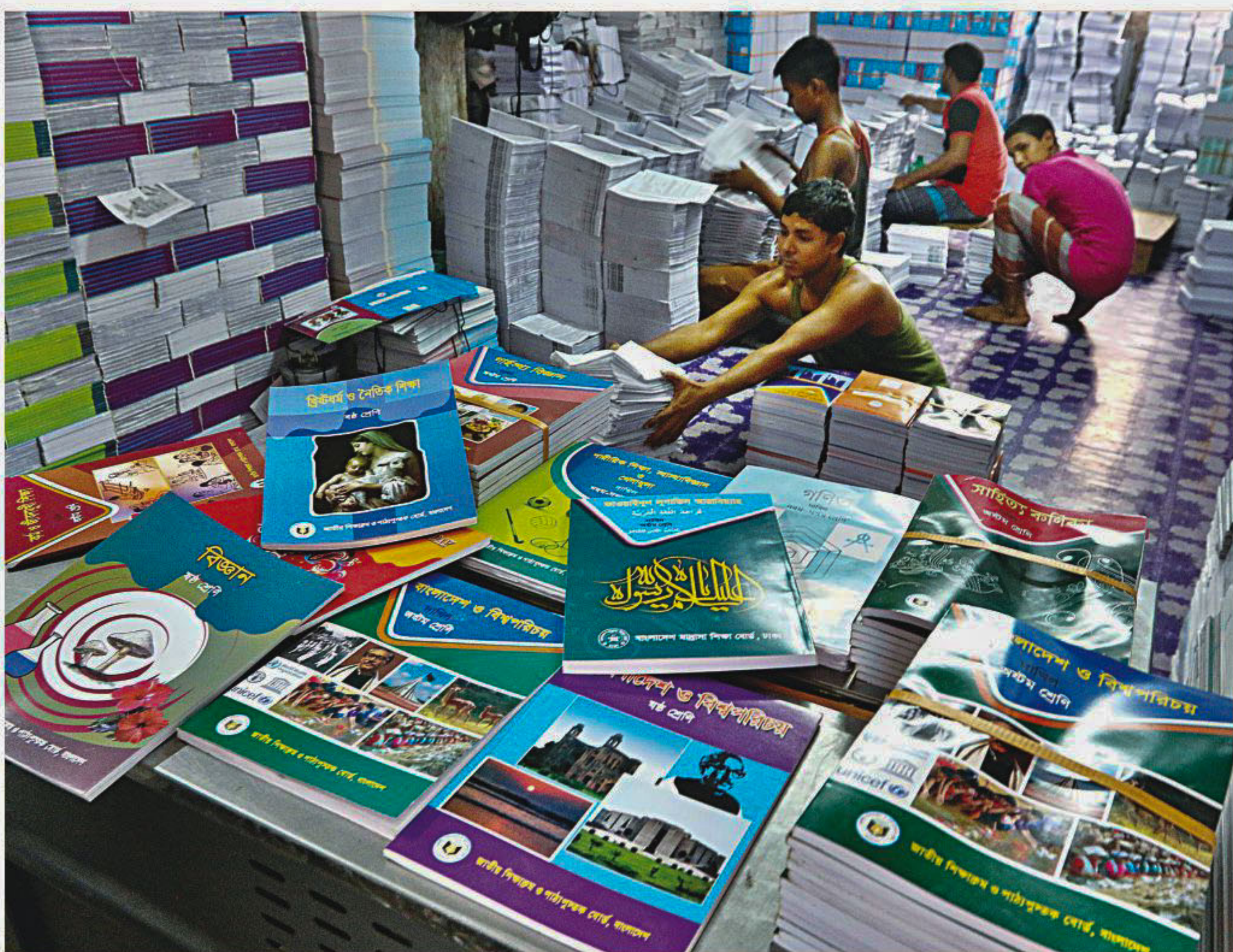
Workers sort out and stack freshly printed textbooks at a printing house in the capital's Sutrapur area. The government has already started sending new textbooks to upazilas across the country so that students get them for free on the upcoming New Year. The photo was taken a couple of days ago.