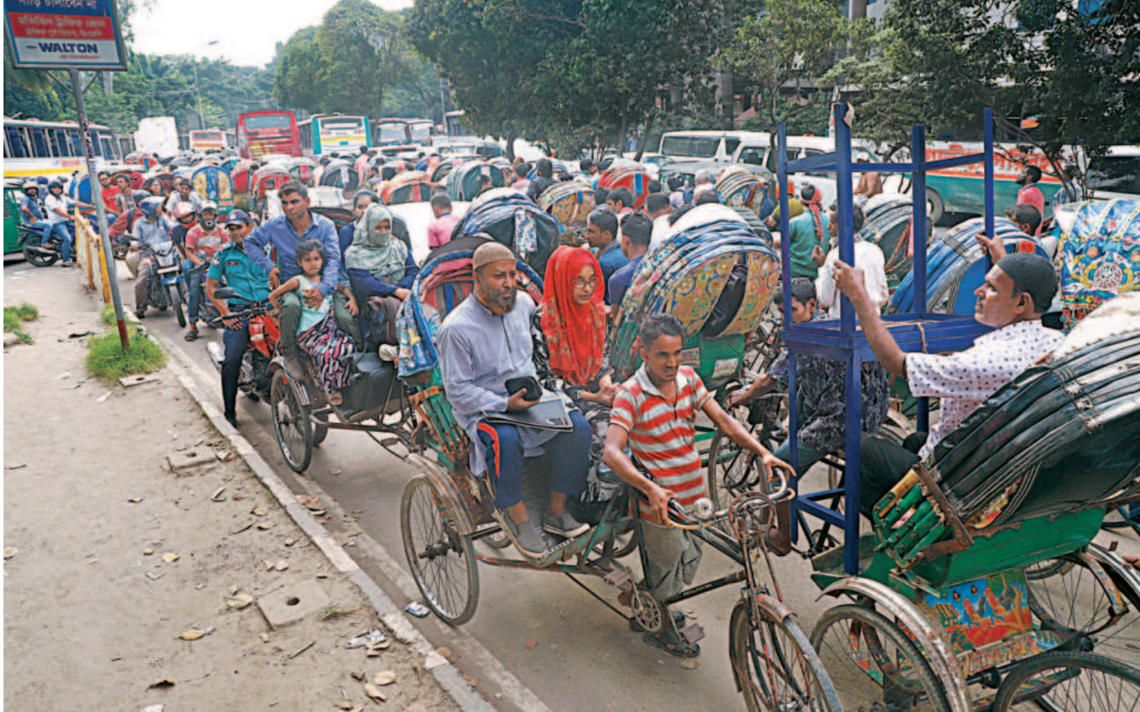
Ignoring a road sign, rickshaws and motorcycles take the wrong side of a street near the Bangabhaban in the capital yesterday. Although Dhaka Metropolitan Police has taken different steps to bring discipline on road, there has hardly been any change. Road rules violations are still rampant.

The Daily Star could not reach Nanak and Sadek for comments over the last few days.