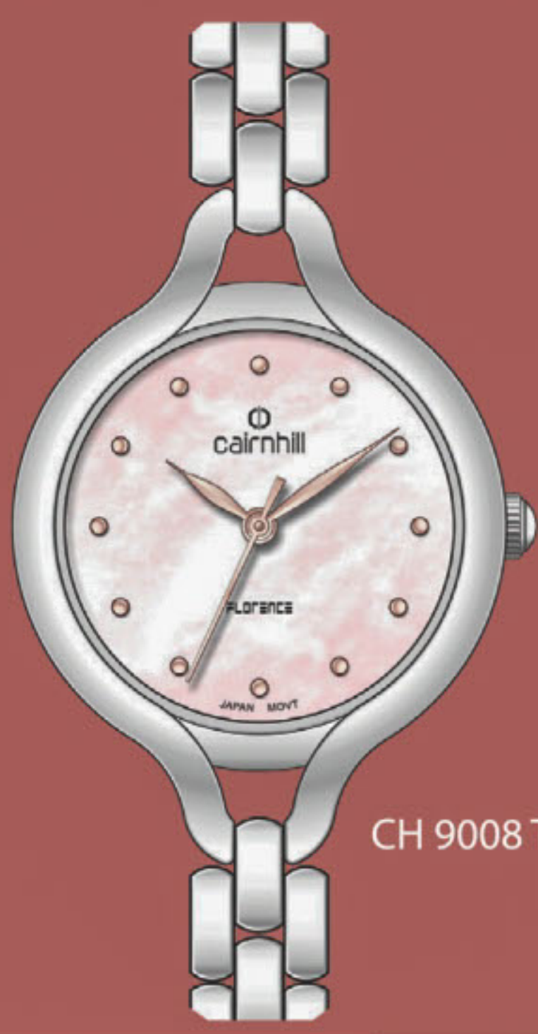
CH 9008 TW

STYLE is an expression of individualism mixed with charisma. FASHION is something that comes after style.