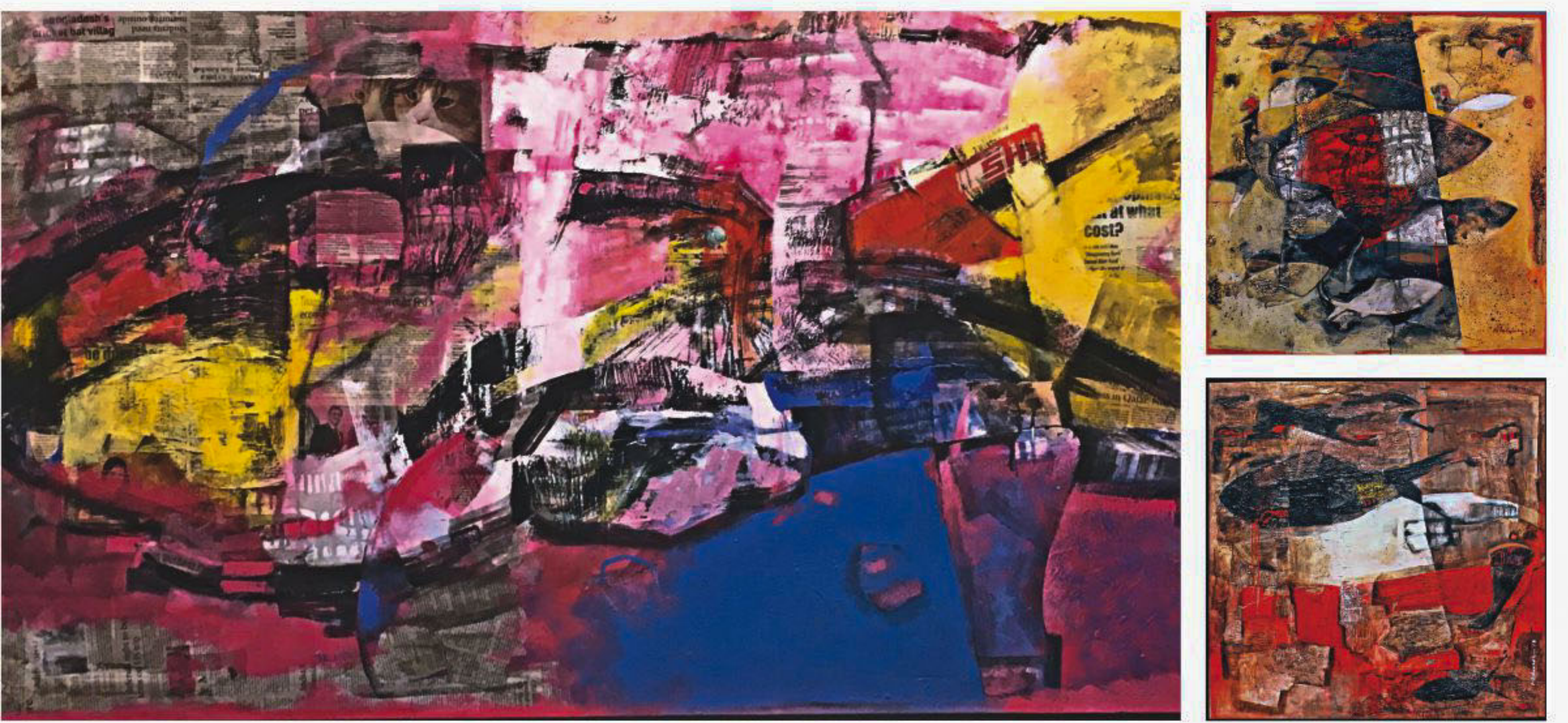
Paintings on exhibit at the event.