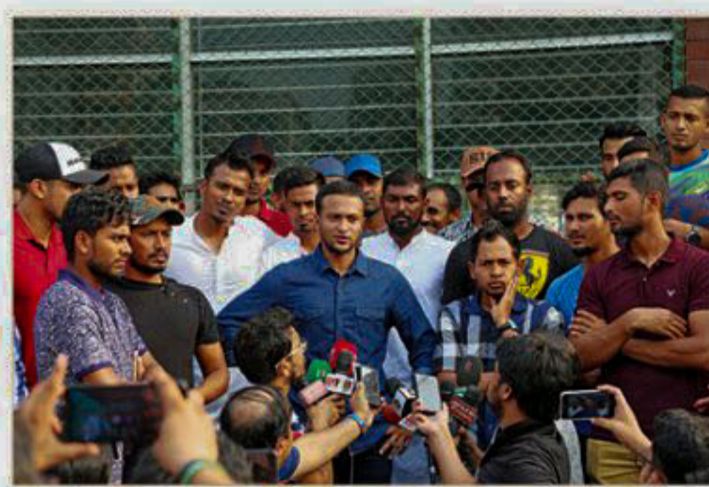
Bangladesh Premier League from next edition, improvement in infrastructure, facilities and increased payments for first-class cricketers.

The cricketers read out their demands one by one. The 11-point demand included the resolution of payment irregularities in the Dhaka Premier League (DPL), a return to the players' transfer system from the players-by-choice system in the DPL, a return to the franchise-based model of the