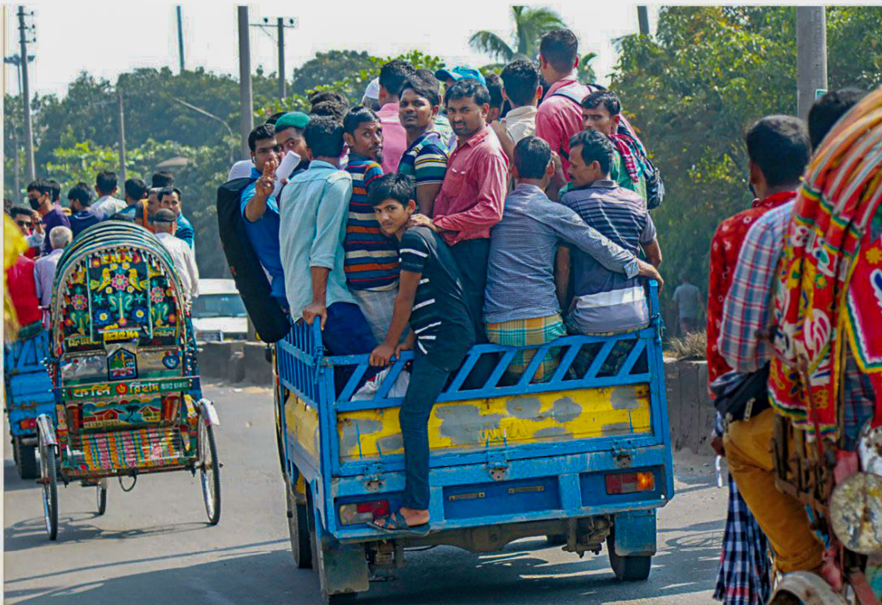
People cram onto pickups after failing to find any public transport in Chattogram city's Nimtola area yesterday morning. Thousands of people in the port city suffered as a section of transport workers enforced a sudden strike, protesting jail sentences handed down to three, including a driver and his helper, for running an unfit bus. Story on page 2.