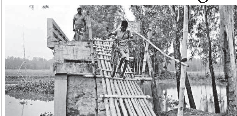
A bridge over a river causes immense sufferings to villagers in Tangail Sadar upazila as it does not have approach roads on either sides.