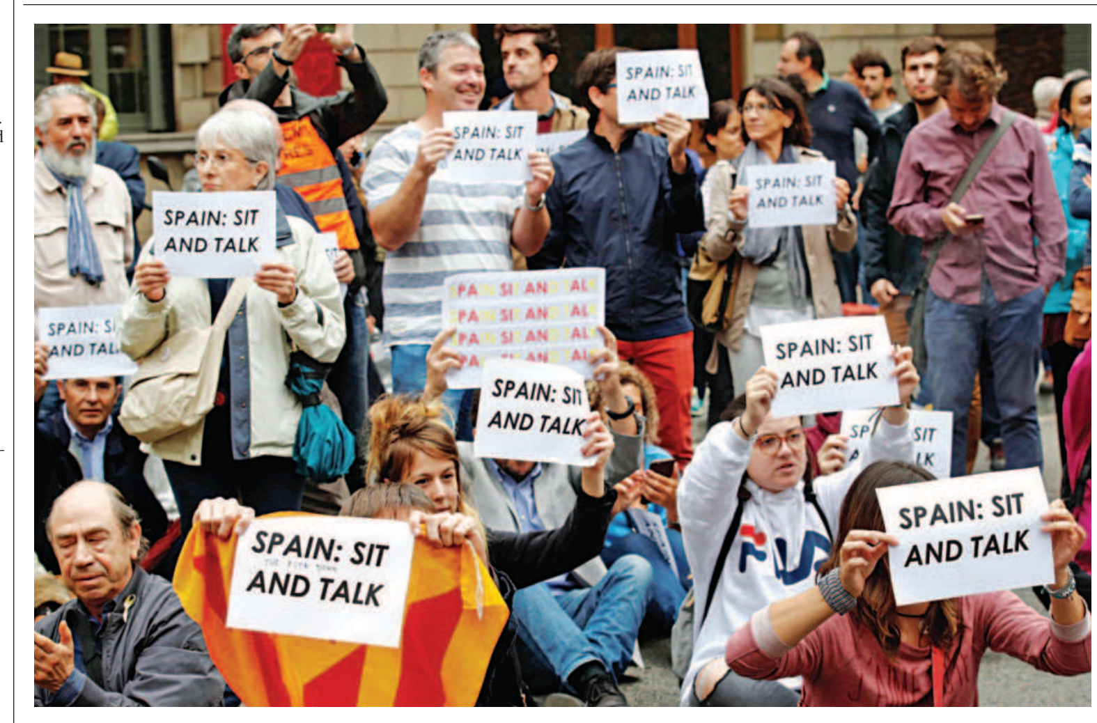
Supporters of Catalonia's independence sit on a street holding placards reading "Spain: Sit and Talk" as they attend a protest rally over the jailing of Catalan separatist leaders outside Spanish Government offices in Barcelona, Spain, yesterday.