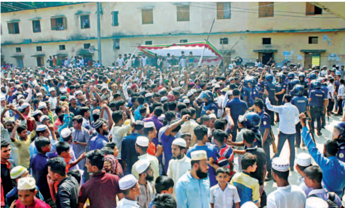
Anti-clockwise, 'Tawhidi Muslim Janata' activists, closely watched by riot police, gather for a rally in Bhola's Borhanuddin upazila yesterday; a video grab shows a protester wielding a stick; an activist with his back covered in shotgun-pellet wounds lying on a hospital bed following the clash with police.