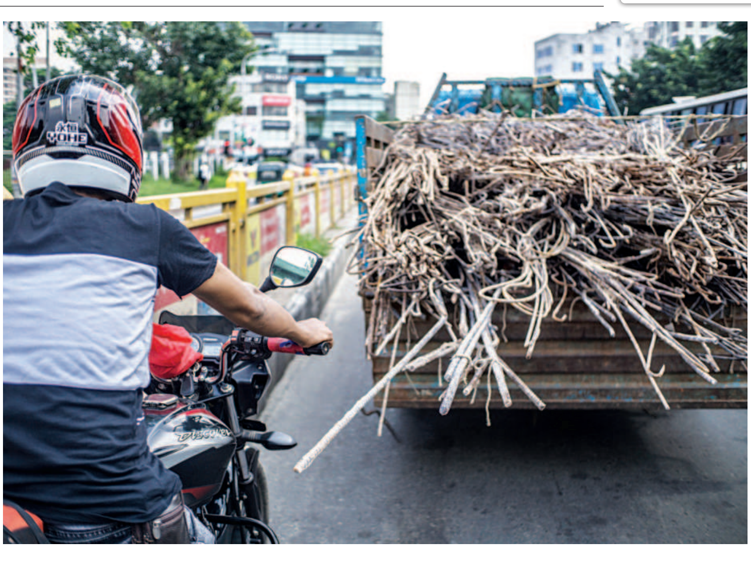
A motorcyclist is dangerously close to rods sticking out of a truck's flatbed in the capital's Bijoy Sharani yesterday. Frequents crashes and mishaps fail to deter such disregard for safety.

His demand for "unconditional" negotiations, addressed to Spanish Prime Minister Pedro Sanchez, appeared to be aimed at ensuring that a referendum on independence, currently a