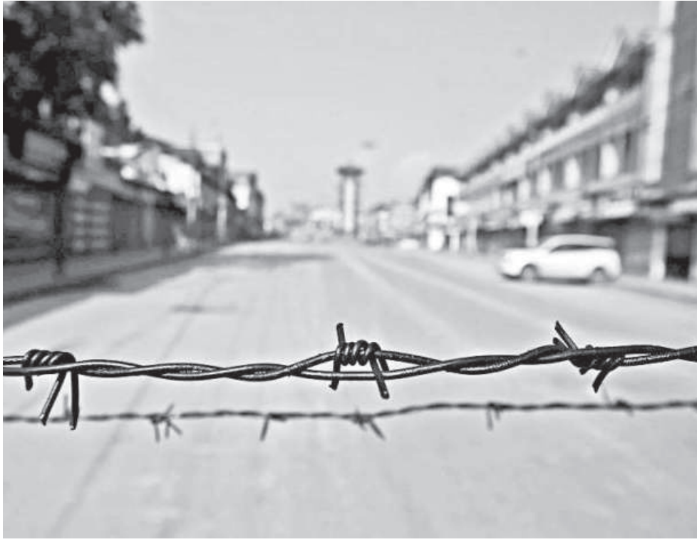
Barbed wire is seen laid on a deserted road during restrictions in Srinagar, on August 5, 2019.

While the decision to revoke the provisions of the constitution is perceived as a betrayal of the accession accord by