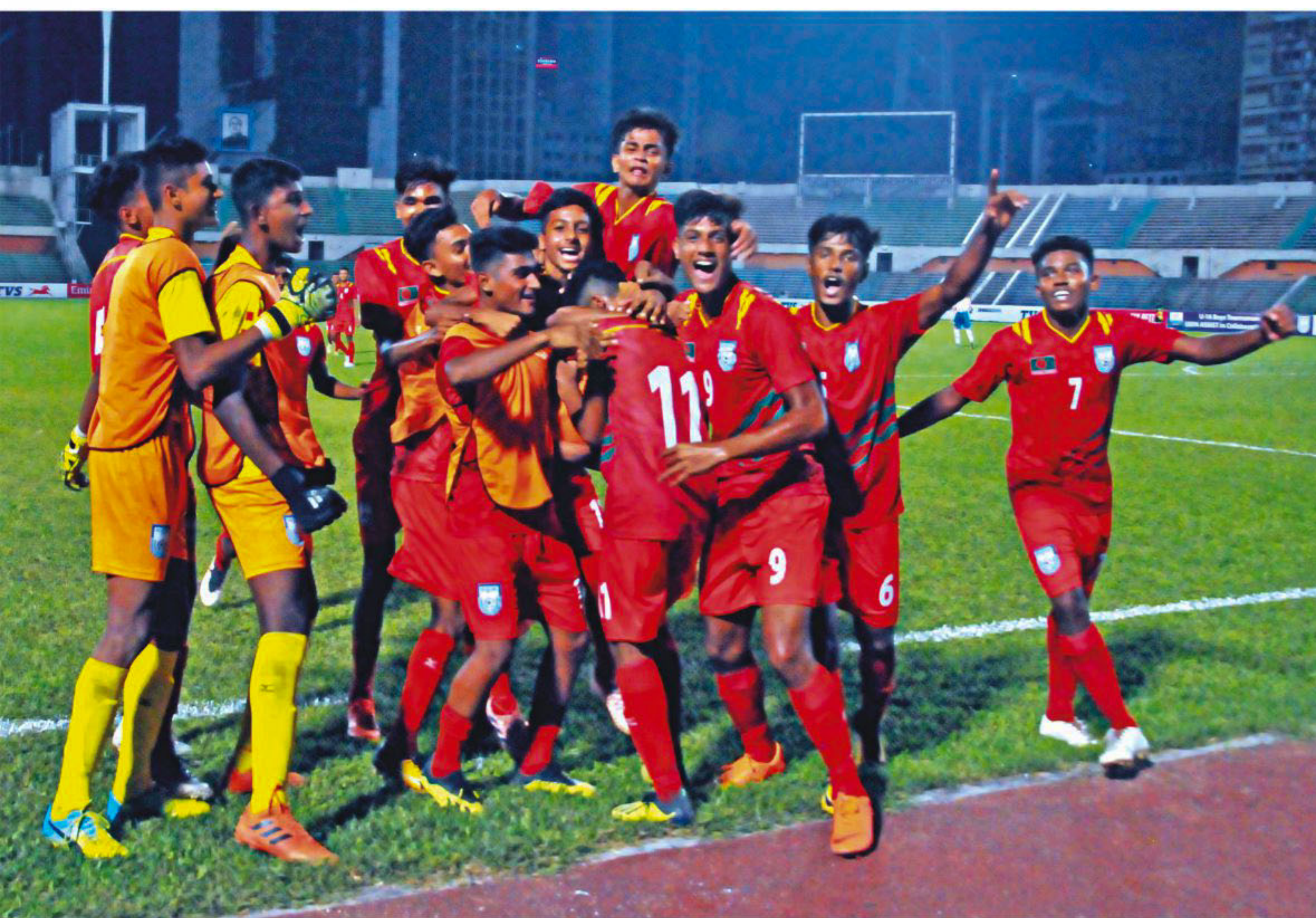
Bangladesh players are over the moon after their 3-1 win over tournament favourites Faroe Islands at the Bangabandhu National Stadium yesterday left them needing just one point from their final game to confirm the title of the UEFA Assist U-16 Football Tournament.

Time: 7:00pm Venue: Ma Aziz Stadium, Chattogram