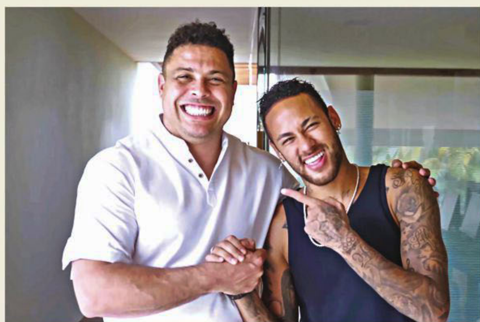
Brazilian legend Ronaldo Nazario met with the man currently leading his country, Neymar, and the pair sat down for a chat.