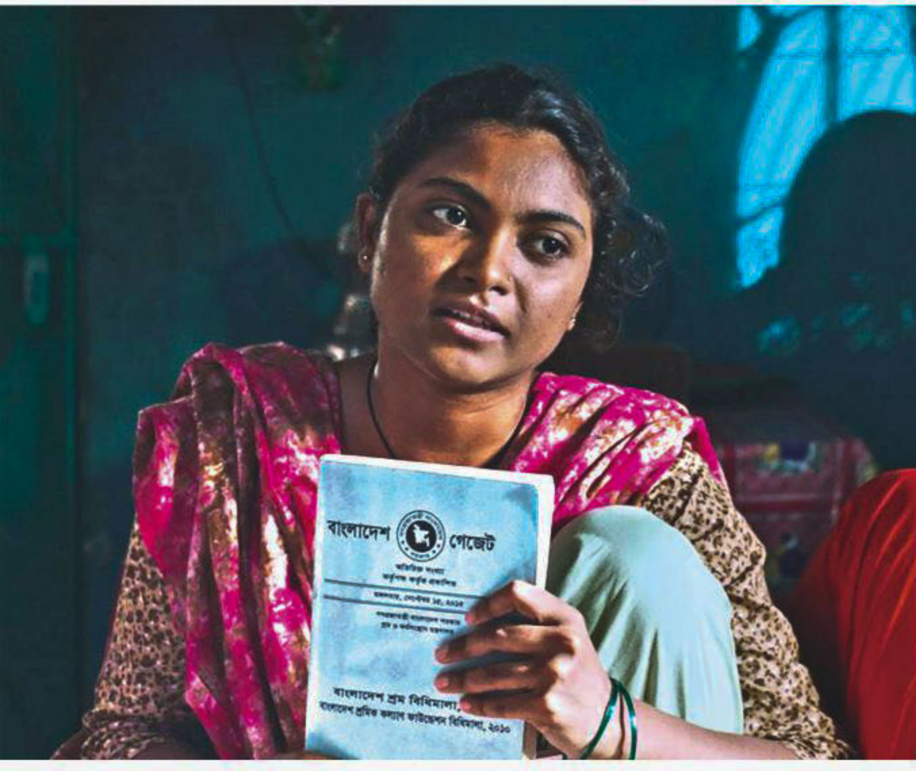
A still from the film.

Online tickets are now available. Those who have Litmosphere membership cards, will get an exclusive discount on the entry tickets. You will get an even better deal if you register online. For more information and online ticket registration visit: http://litmosphere.club/event.html . If you have any questions, feel free to message Litmosphere on their official Facebook page or send them an email to litmospherebd@gmail.com