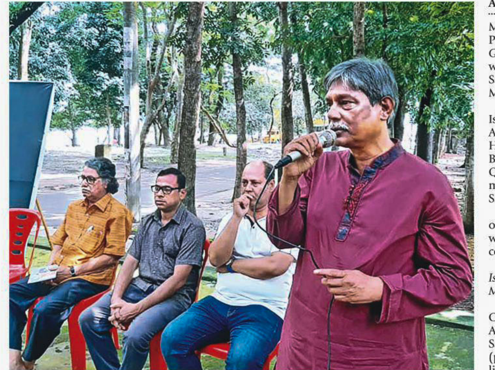
Speakers at the discussion.