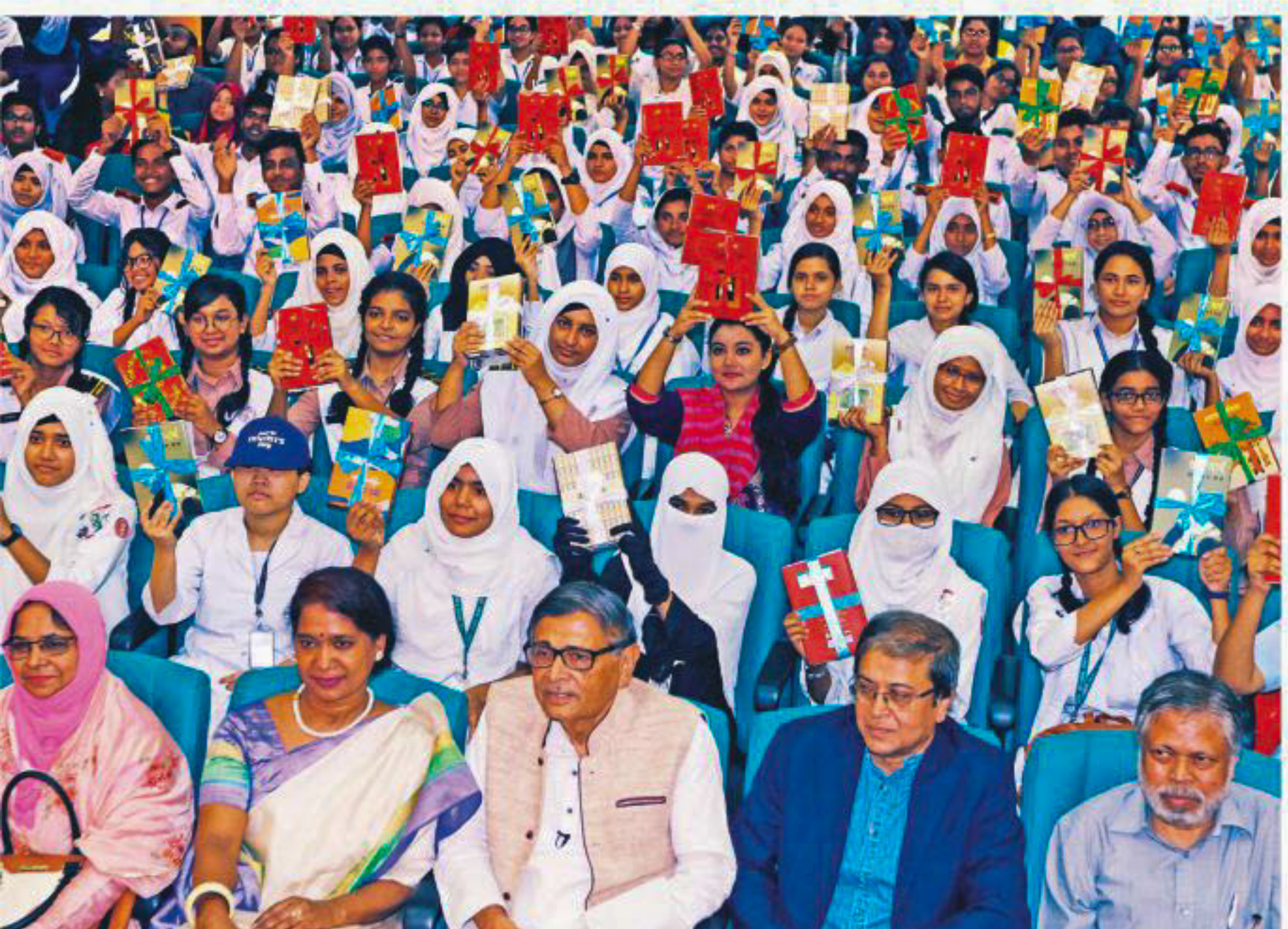
Prof Abdullah Abu Sayeed with winners of Bishwo Shahitto Kendro book reading contest at Bangla Academy yesterday.