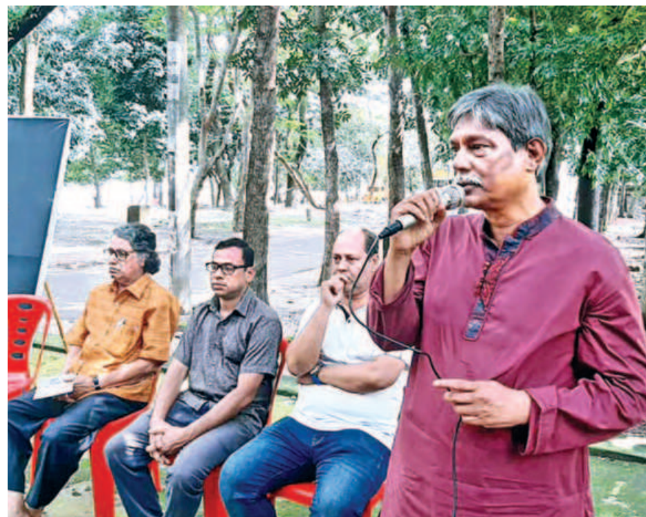
Speakers at the discussion.