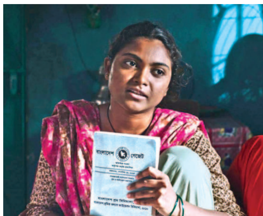
A still from the film.

Online tickets are now available. Those who have Litmosphere membership cards, will get an exclusive discount on the entry tickets. You will get an even better deal if you register online. For more information and online ticket registration visit: http://litmosphere.club/event.html . If you have any questions, feel free to message Litmosphere on their official Facebook page or send them an email to litmospherebd@gmail.com