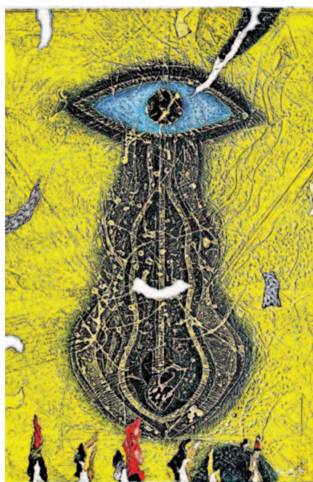
Kalidas Karmakar's painting on display at the exhibition.