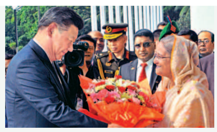
Prime Minister Sheikh Hasina receives Chinese President Xi Jinping at her office in Dhaka on October 14, 2016.

In Bangladesh, the projects must get approval from several committees,