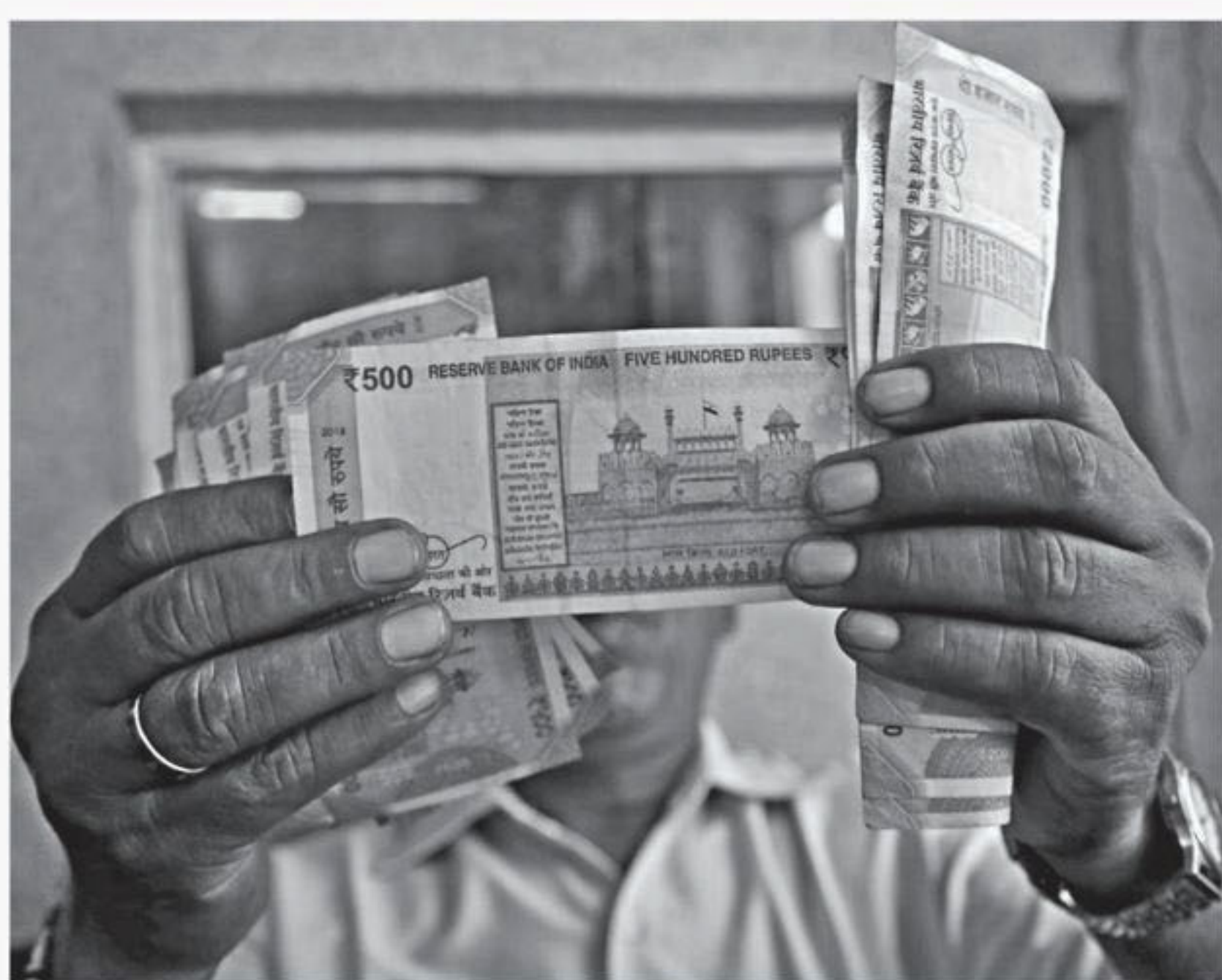
A cashier checks Indian rupee notes inside a room at a fuel station in Ahmedabad.

The government has yet to decide if it wants to announce more fiscal measures to boost growth or leave