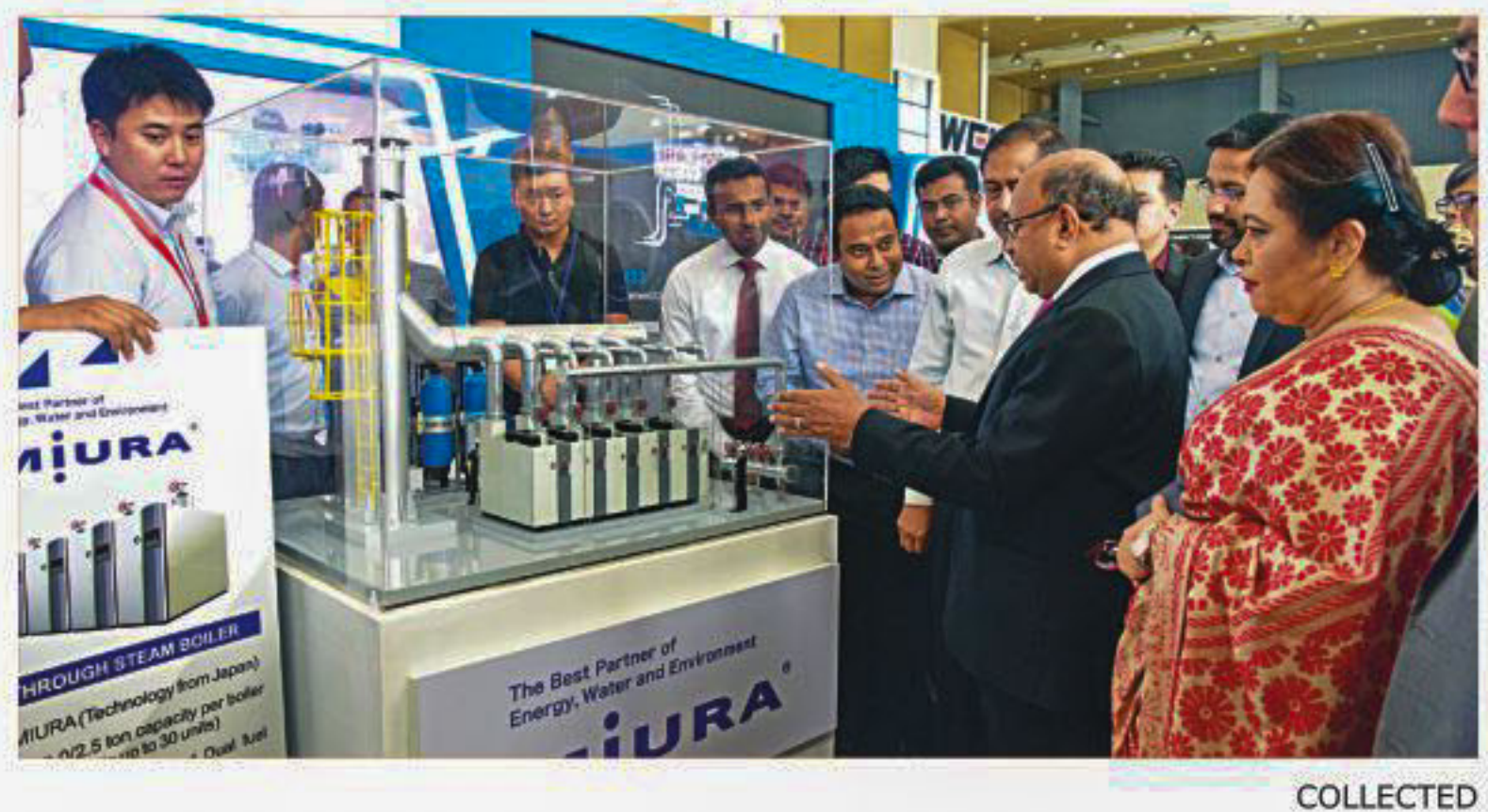
LGRD Minister Md Tazul Islam visits a stall at Build Bangladesh International Expo-2019 at International Convention City Bashundhara in Dhaka yesterday.

The fair is said to be showcasing the latest and innovative concepts, equipment, technologies and services related to infrastructure development of companies,