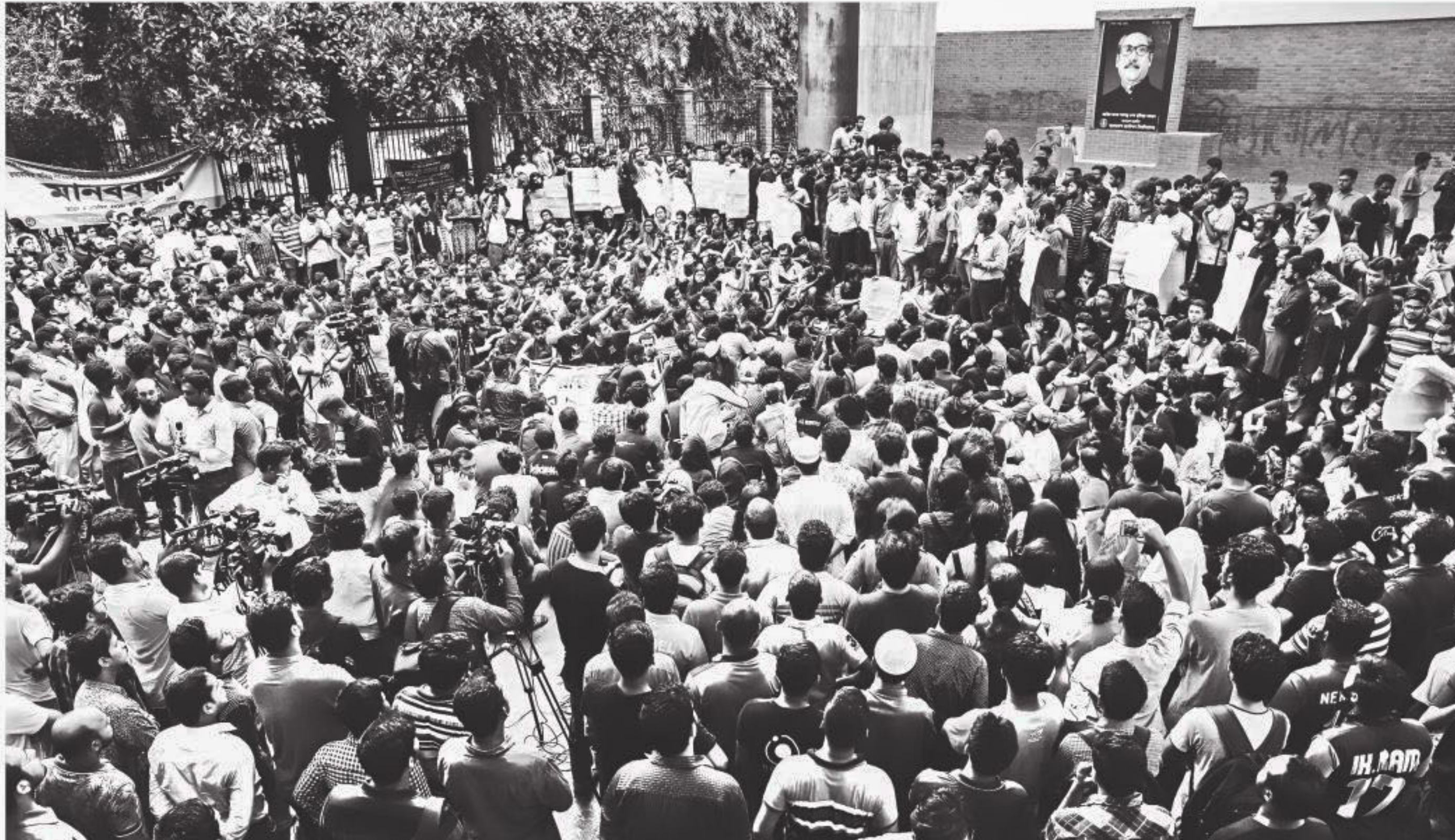
It is clear that the formation of the student wings of political parties, like Chhatra League and Chhatra Dal, is prohibited by law.

The defiance of the RPO and the violations of the Penal Code have turned our students into monsters and killers. Since independence, we have seen 151 killings in various campuses, the latest being Abrar Fahad's. Thus, the death of Abrar is primarily the result of the lack of rule of law, which created a culture of impunity not only in Buet campus, but also throughout Bangladesh.