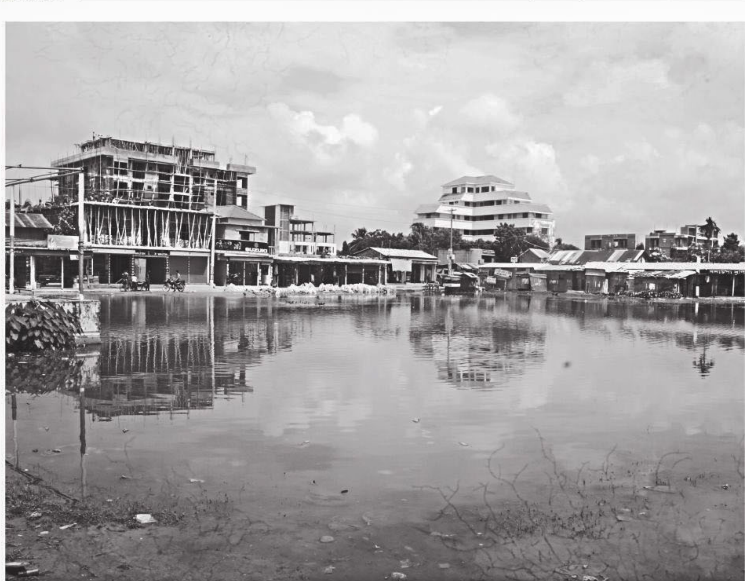
The open ground in front of the Rakhine Mahila Market in Kalapara upazila of Patuakhali.

"In coming dry season, we will dump sand on the field and build a permanent drainage system. We will also renovate the stage," he added.