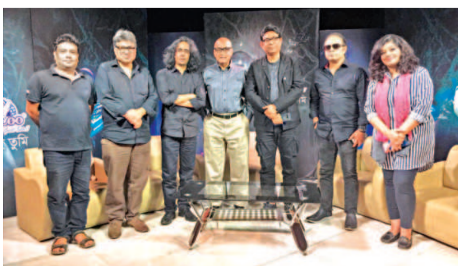
'Shei Tumi' on Desh TV