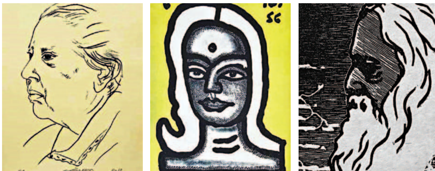
(From left) Artworks by Murtaja Baseer, Jogen Chowdhury and Anisuzzaman.