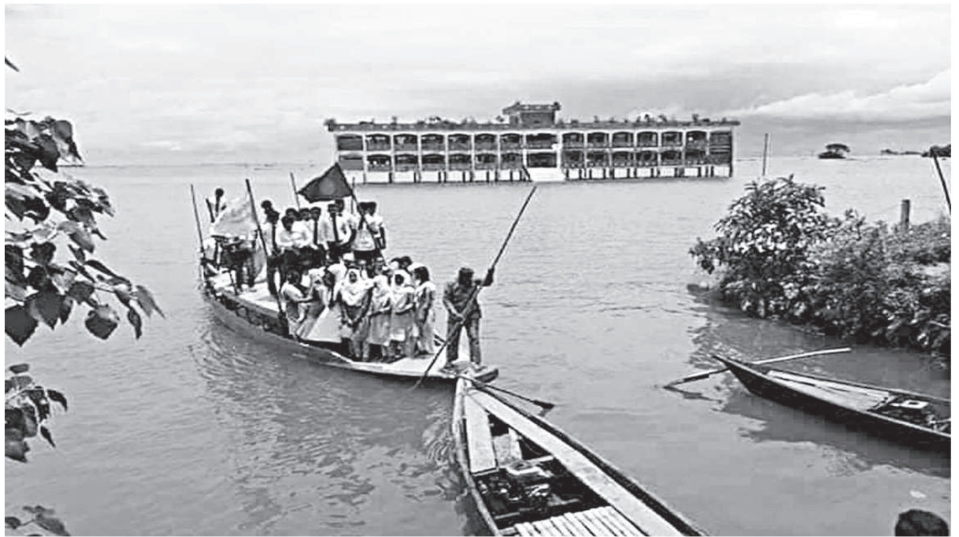
Students of Baherbali SESDP Model High School in Kishoreganj's Bajitpur upazila cross the water body on an engine-run boat to get to their school amid risk of accident. The boat is the only mode of transportation to go to the school.

It crosses the Bangladesh territory through Ramkrishnapur in Daulatpur upazila of Kushtia, proceeds through Chuadanga district, reaches West Bengal again and merges with the Hugli river.