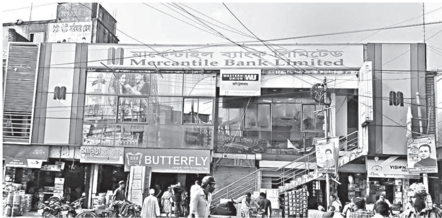
The district administration has served a notice, below, to the owners of this building at Mokhtar Foara Chattar under Sakhipur municipality area in Tangail, asking them to remove the structure as it was built allegedly on an illegally occupied government land.

The amount will be spent for repairing and beautification work of the school and to arrange at least two more engine-run boats for the students, he said.