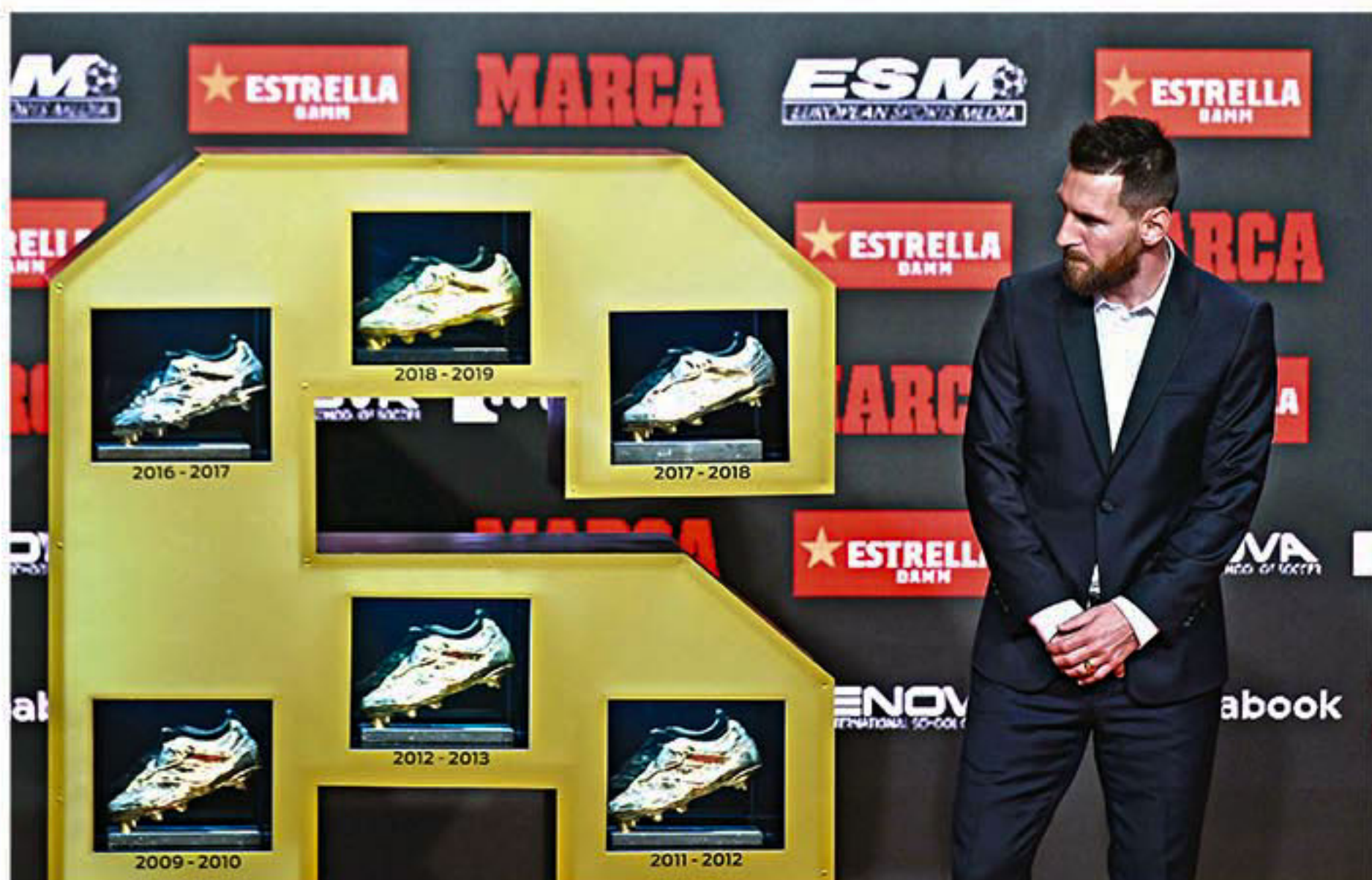
Even Lionel Messi must have been left pondering just how he had accomplished such a feat as he looked mesmerised by his sixth Golden Shoe -- the award for finishing as the top-scorer in European Leagues -- yesterday. Messi said: "Without my team, I could not even have won the award once."

"Neymar, [Kylian] Mbappé, [Edinson] Cavani, are all strong players. It is nice to play with star players who change matches even at the last minute, like Neymar does."