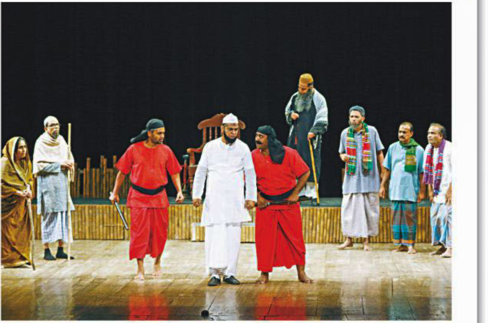
'Rohu Chandaler Har' by Arshinagar and 'Pa er Awaj Pawa Jaye' by Theatre, were staged at the Ganga Jamuna Cultural Festival at Bangladesh Shilpakala Academy on October 15.