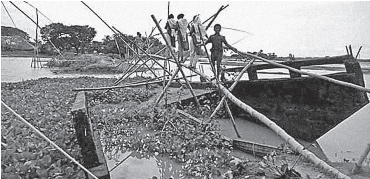
Schoolchildren cross the risky makeshift bamboo bridge on Krishnapur canal in Netrakona’s Kalmakanda upazila.

Hundreds of people from adjacent Krishnapur, Raypur, Bishauti, Banaikona, Burimari and Rongchhati villages also use the road to reach Kalmakanda and Netakona for their daily purposes, said the UP member.