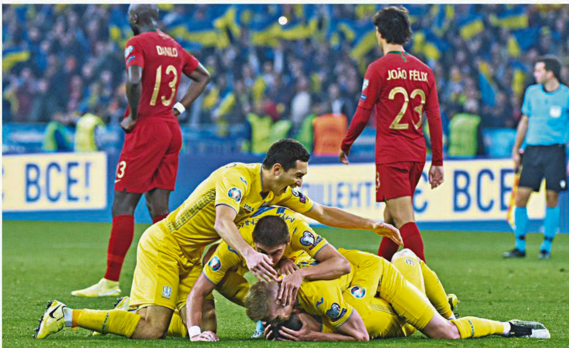
Ukraine players celebrate after securing qualification for the 2020 UEFA European Championships with a 2-1 win over Portugal on Monday. (Bottom) Cristiano Ronaldo scored his 700th career goal in the match.