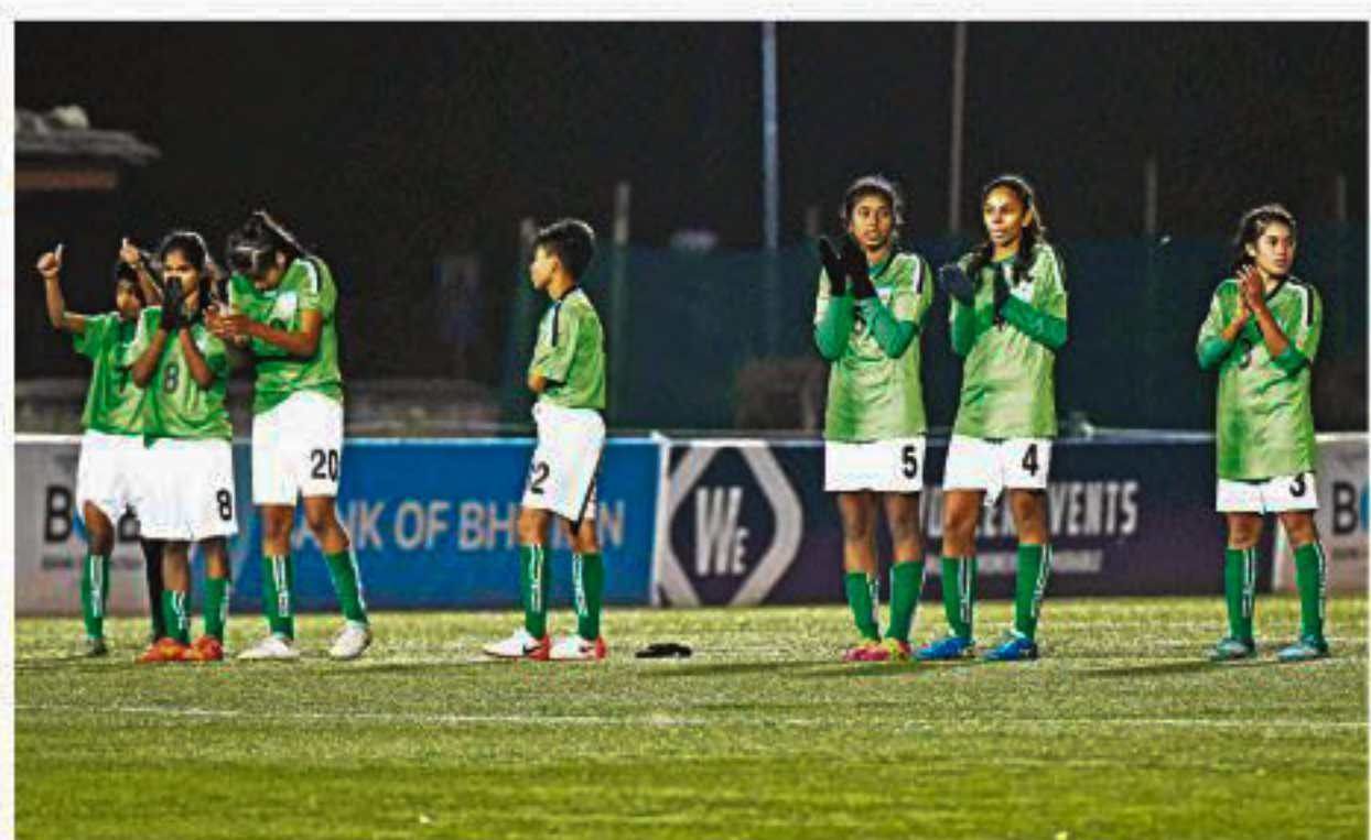
Bangladesh players wait tensely during the tiebreaker in the final of the SAFF U-15 Women's Championship against India at the Changlimithang Stadium in Thimphu yesterday.