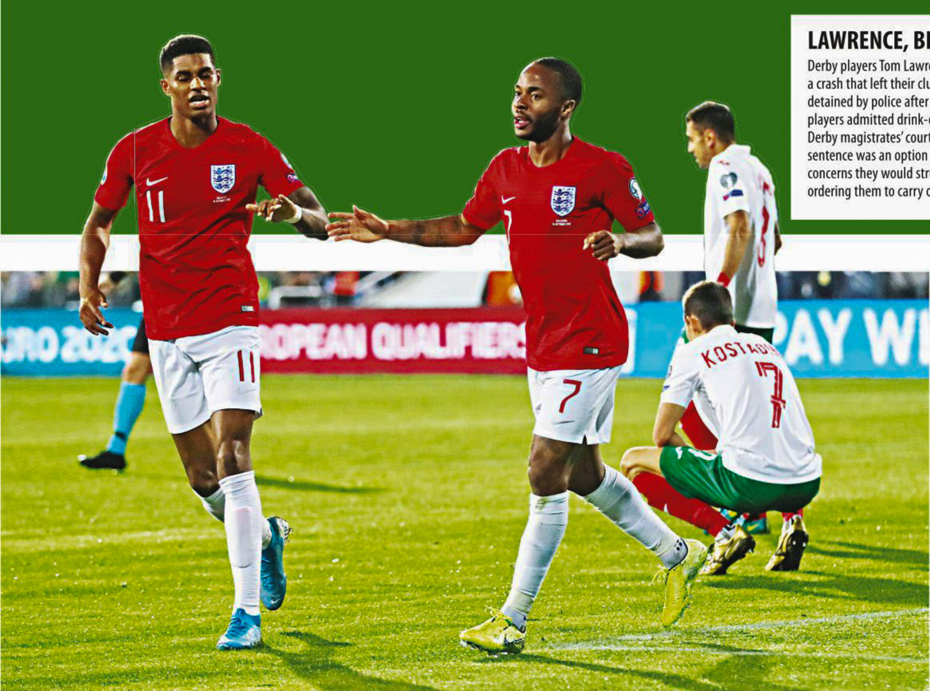
England forwards Marcus Rashford (L) and Raheem Sterling both got their names on the scoresheet during a 6-0 rout of Bulgaria in a 2020 UEFA European Championships qualifier at the Stadion Vasil Levski in Sofia on Monday.