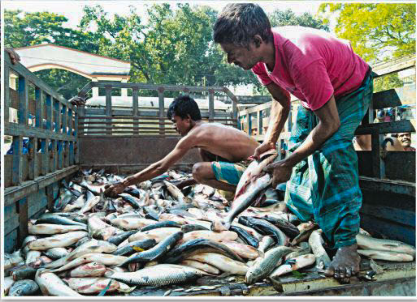
The local administration on Monday freed Kaicha Beel, a government-owned waterbody in Jagannathbari Mouja of Tangail's Gopalpur upazila, from an illegal occupier. Inset, fish netted from the waterbody is taken to the premises of Nagda Shimla union parishad for distribution among orphans.