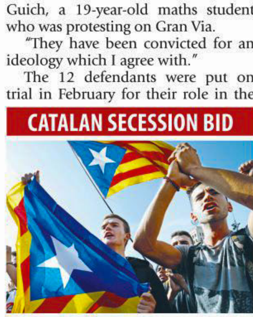
CATALAN SECESSION BID