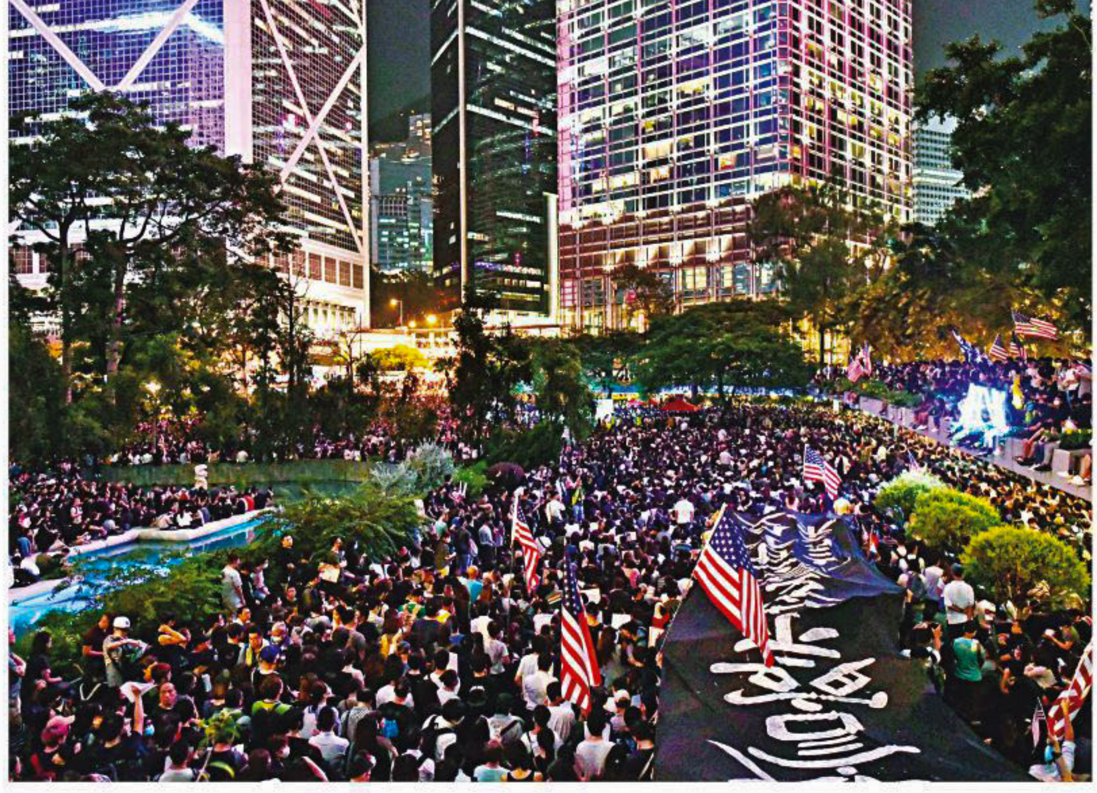
Protesters attend a rally in Hong Kong yesterday, calling on US politicians to pass a bill that could alter Washington's relationship with the trading hub. Strife-torn Hong Kong is sliding towards becoming a police state, US senator Josh Hawley warned, as the financial hub braces for a rally calling on Washington to punish China over sliding freedoms.