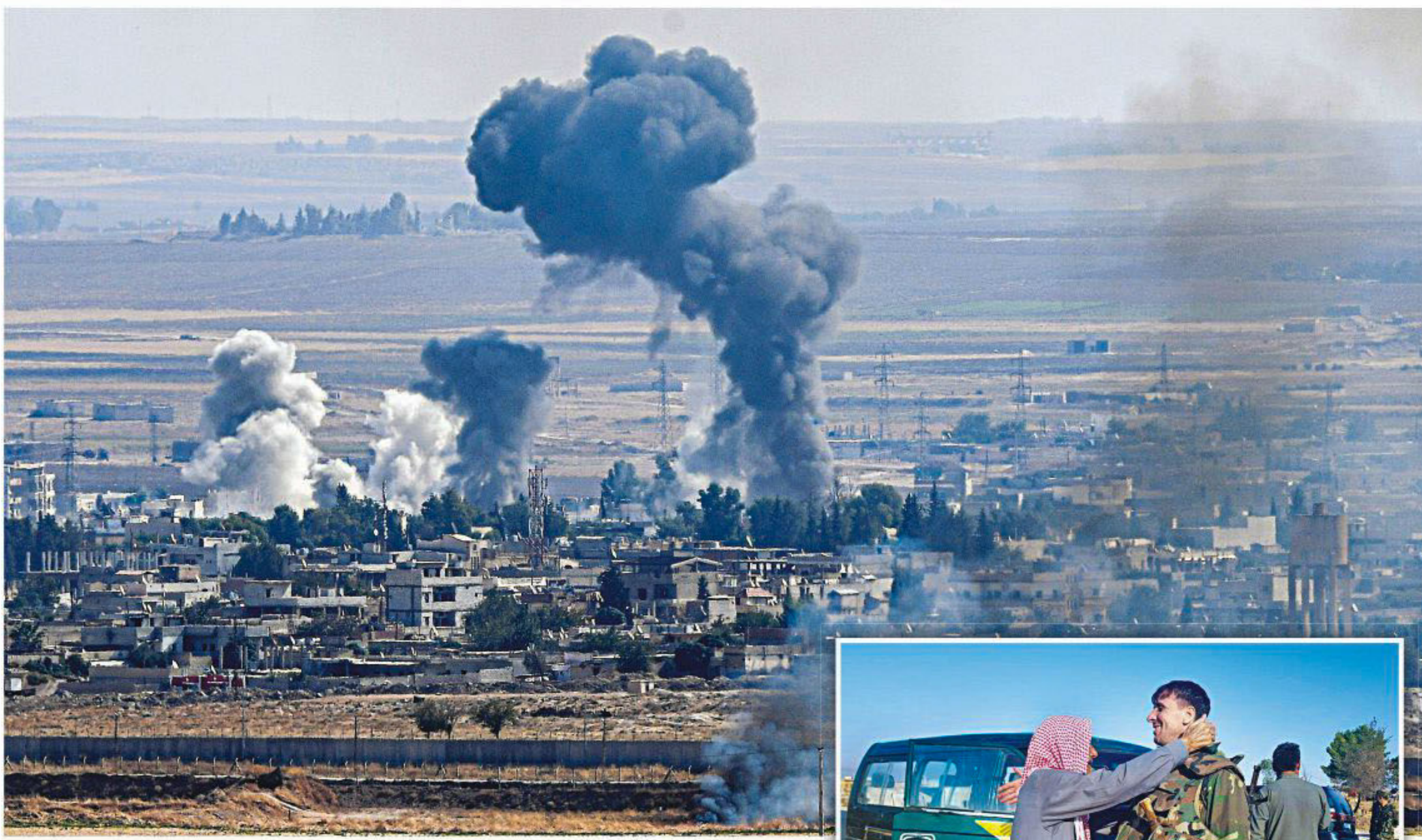
This picture taken yesterday shows smoke rises from the Syrian town of Ras al-Ain, from the Turkish side of the border at Ceylanpinar district in Sanliurfa, on the sixth day of Turkey's military operation against Kurdish forces. Inset, Syrians welcome regime forces at the western entrance of the town of Tal Tamar in the countryside of Syria's northeastern Hasakeh province.