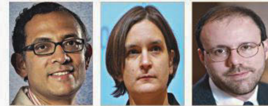
Abhijit Duflo Kremer NOBEL ECONOMICS PRIZE