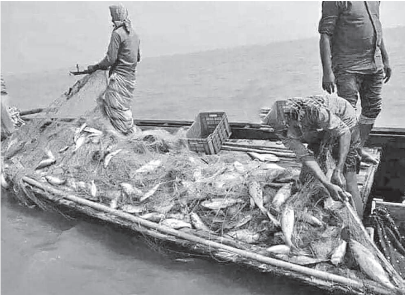
Fishermen catching brood hilsha in the Meghna in Munshiganj despite an ongoing ban against it.

They alleged that the ruling AL men were resisting voters and BNP men to go to polling centres.