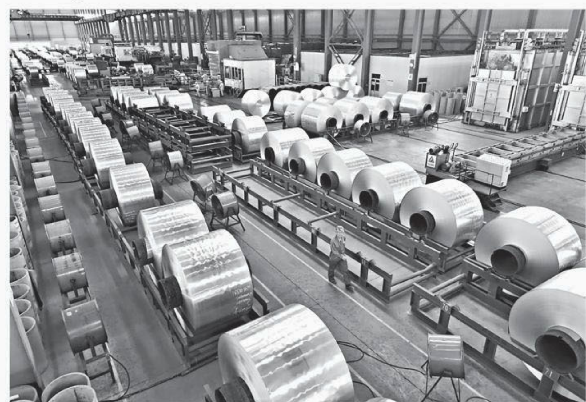
Workers are seen next to aluminium rolls at a plant in Binzhou, China.

But "a significant improvement is... not