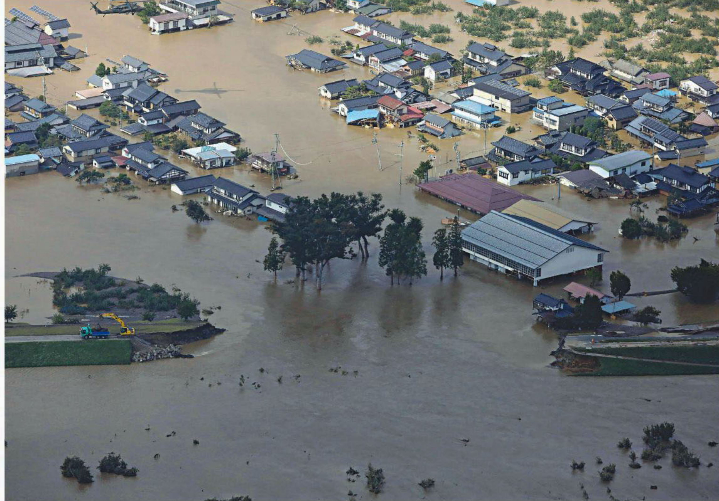
This aerial view shows flooded homes beside a collapsed bank of the Chikuma river in Nagano, Nagano prefecture yesterday, a day after Typhoon Hagibis swept through central and eastern Japan.