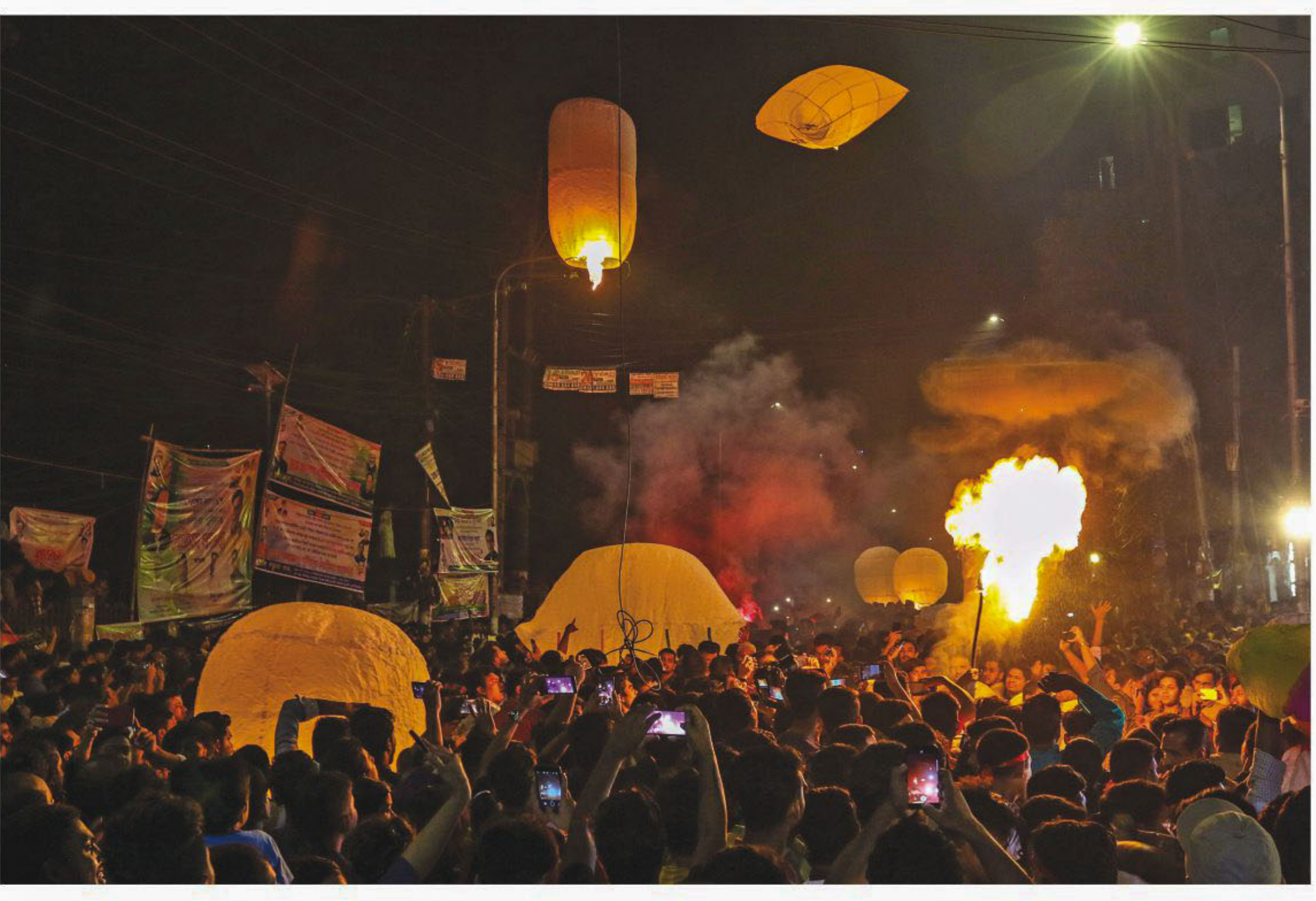
Sky lanterns, known as fanush, take flight, as people gather yesterday at Buddha Mandir in Chattogram's Nandan Kanon area to celebrate Prabarana Purnima, the second biggest religious festival of the Buddhist community in Bangladesh. This full moon night marks the conclusion of a three-month long seclusion of Buddhist monks -- in their monasteries -- for self-education and atonement.