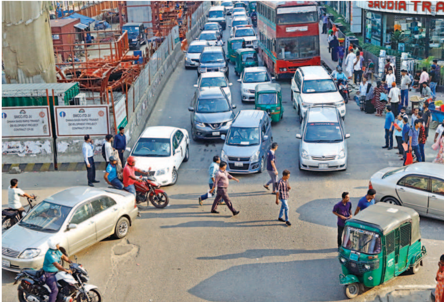
It's anyone's game at Bangla Motor intersection. Pedestrians crossing amid haphazard traffic, motorbikes trailing behind, cars squeezing through the vacant space, and an officer watching helplessly -- all coming together to create a perfect Dhaka pandemonium. The photo was taken yesterday.