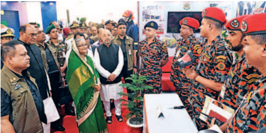
Prime Minister Sheikh Hasina joined the inauguration for International Disaster Mitigation Day at Bangabandhu International Conference Centre yesterday.