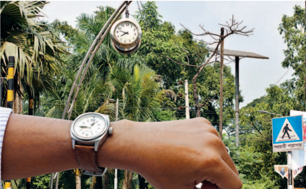
A comparison of the actual time and the time being showed by this clock put up by the DSCC around four years ago on Ramna Road. The clock stopped working six months into operation and it serves as a reminder that many projects are undertaken but little to no effort is given to their maintenance. The photo was taken yesterday.