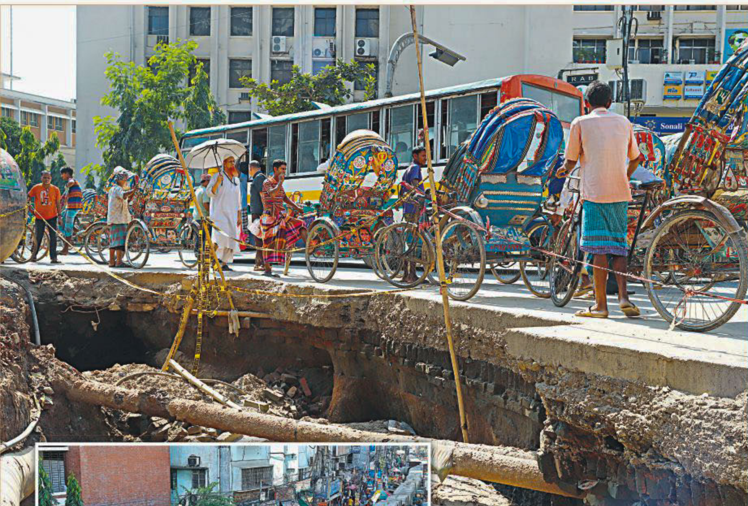
Traffic at Shapla Chattar, Motijheel, the heart of the capital, are inches away from the large hole dug on the road for installing sewer lines. Inset, precast sewer pipes occupying one side of Toyenbee Circular Road in front of Notre Dame College. The photos were taken yesterday.