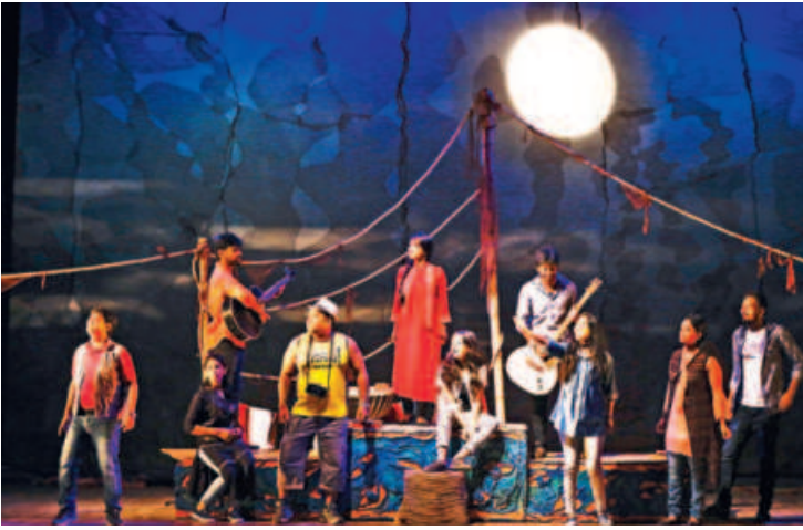
(L)'Hason Janer Raja' staged by Prangonemor troupe at National Theatre Hall, BSA. (R) Spondon's performance at the inaugural ceremony