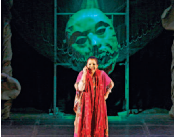
(L) Dhaka Theatre's 'Ponchanari Akhyan' staged at Experimntal Theatre Hall, BSA. (M) Guests and organisers at the inaugural ceremony. (R) Palakar troupe's 'Ujane Mrityu' staged at Studio Theater Hall, BSA

Album Launch Title: Kichu Kotha Kichu Gaan - Launch of Ghaashphoring Choir's Album Date: October 19 Venue: Bangladesh Shilpakala Academy Time: 5:30 pm onwards