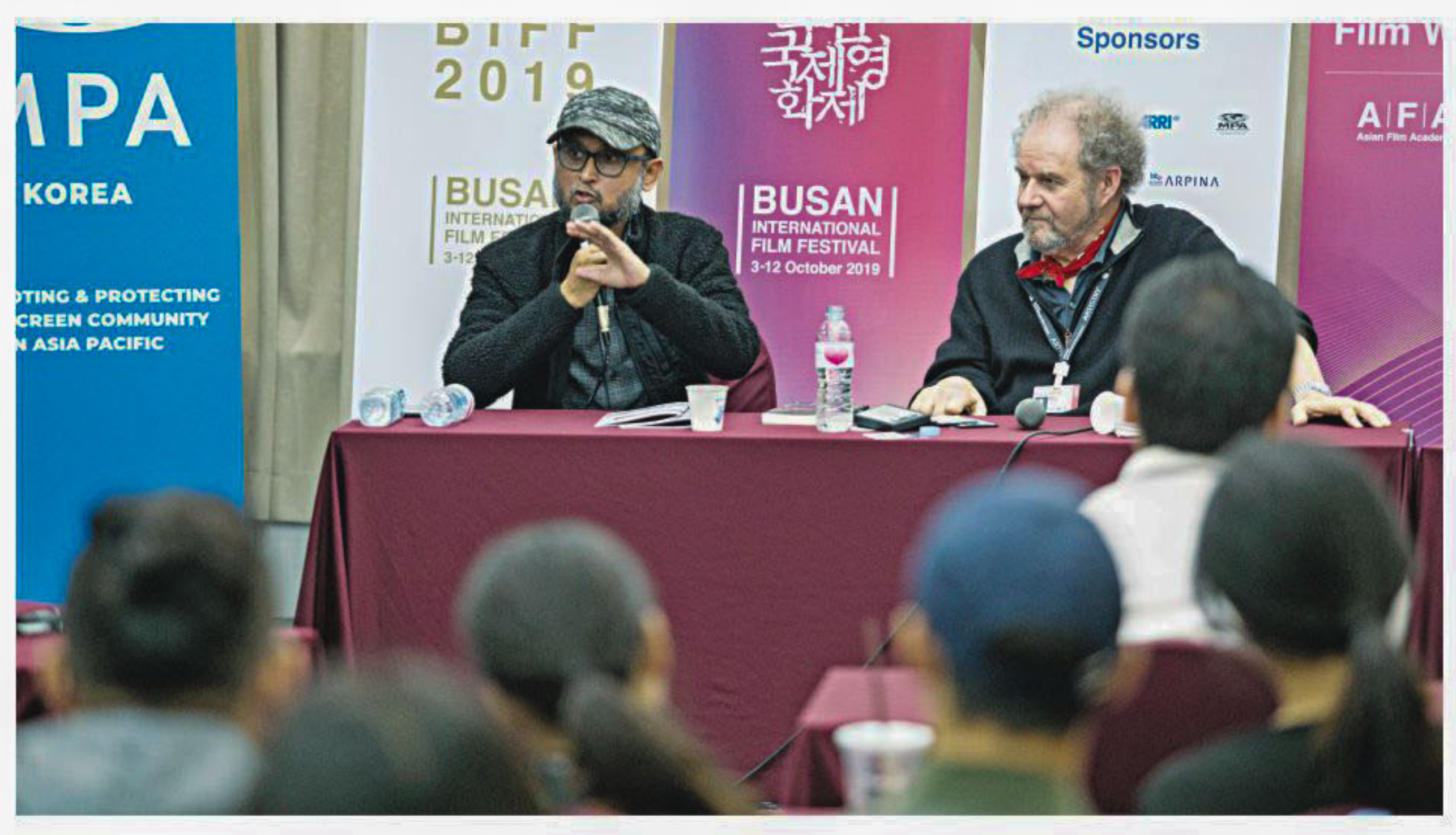
(From left) Mostafa Sarwar Farooki and Mike Figgis.

ARTS & ENTERTAINMENT DESK The Motion Picture Association of America, in association with Asian Film Academy, hosted a workshop and pitching contest titled, 'Bridge to Hollywood', in Busan recently. Internationally acclaimed director Mostafa Sarwar Farooki and Mike Figgis, the Oscar-nominated British director of Leaving Las Vegas , were the mentors of the workshop. Figgis presided over the jury of the New Currents section at the 24th edition of the Busan International Film Festival. The two directors discussed their filmmaking philosophies and the challenges of filmmaking on the first day of the programme. The pitching contest was held on the second day. The Motion Picture Association of America will send the winner of the contest to Hollywood, the home of the US film industry, for training them in filmmaking. A total of 24 fellows from across the world participated in the workshop and contest through Asian Film Academy.