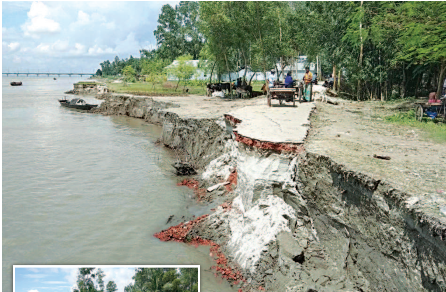
Part of Beltia village in Tangail's Kalihati upazila is being devoured by the Jamuna on Thursday, a day after erosion hit the area, about two kilometres off the eastern end of Bangabandhu Bridge.