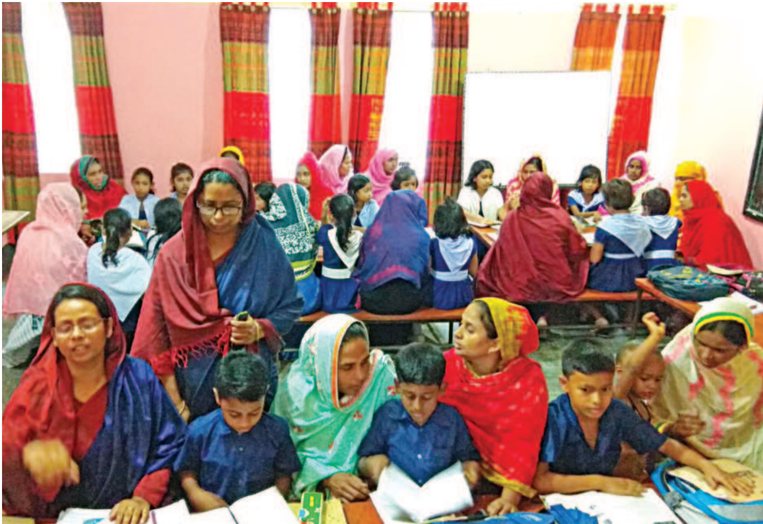
Mothers of third graders attend a class with their children at Shankarbari Polladanga Government Primary School in Chapainawabganj town. The school authorities made this arrangement to help the mothers support their children in improving performance. The photo was taken early this month.