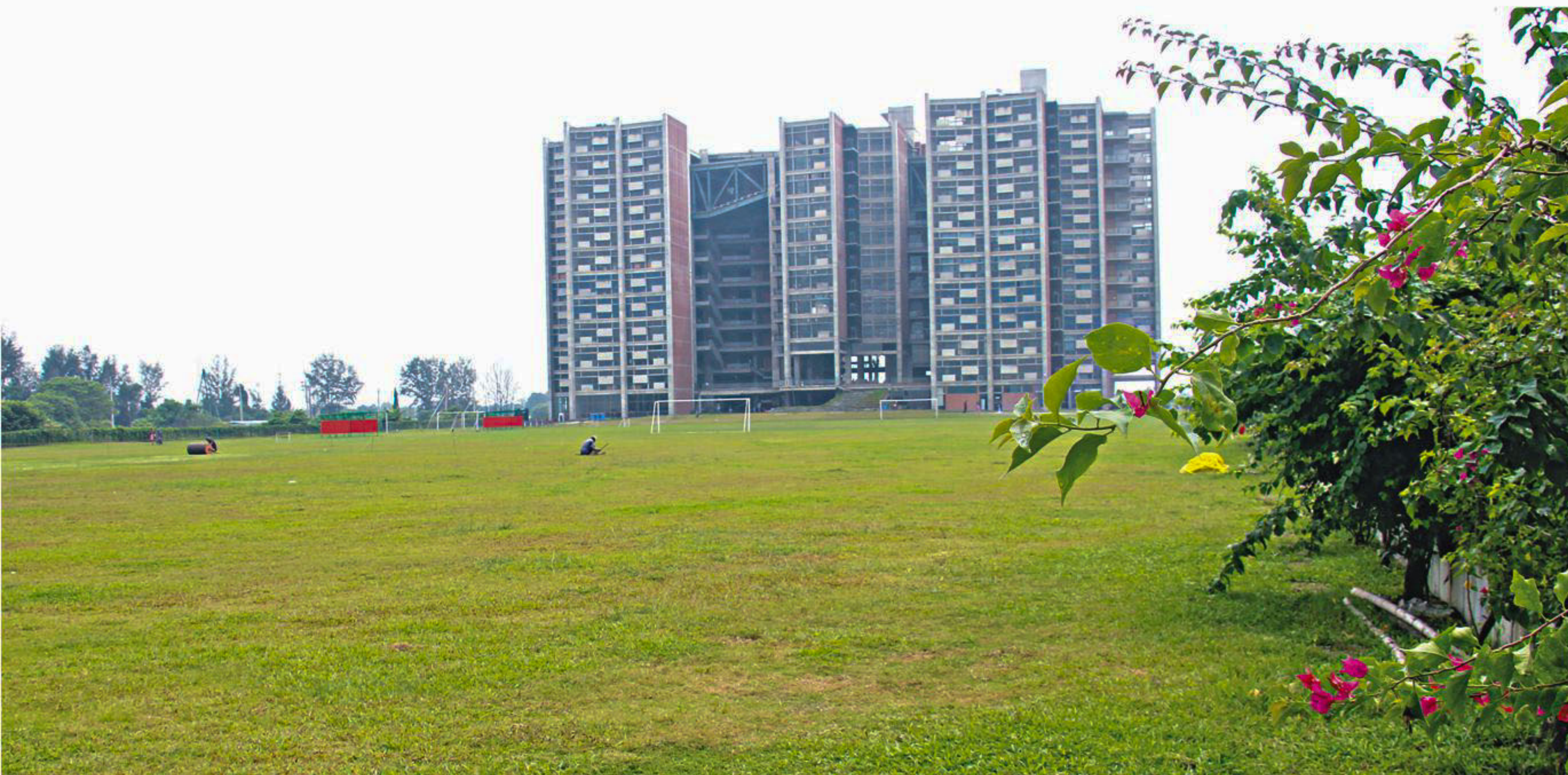
The UIU campus in Madani Avenue.