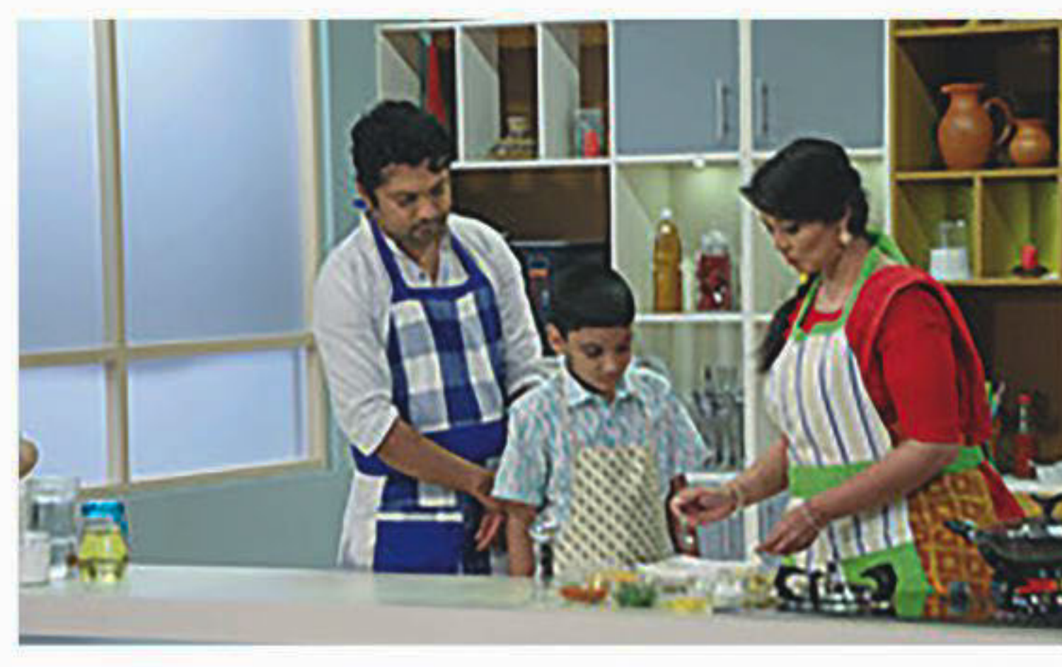
Banai Mojar Khabar Ma-Baba Ar Ami