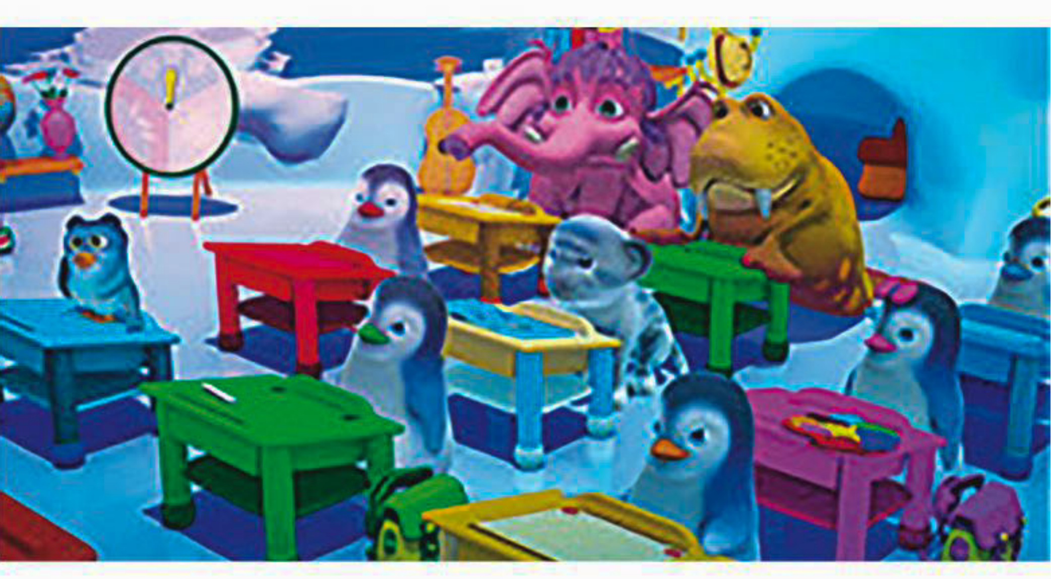
Ozie Boo! Save The Planet