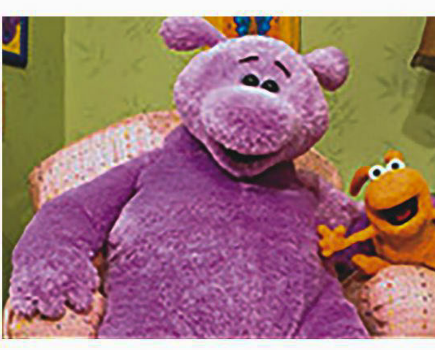
Big and Small