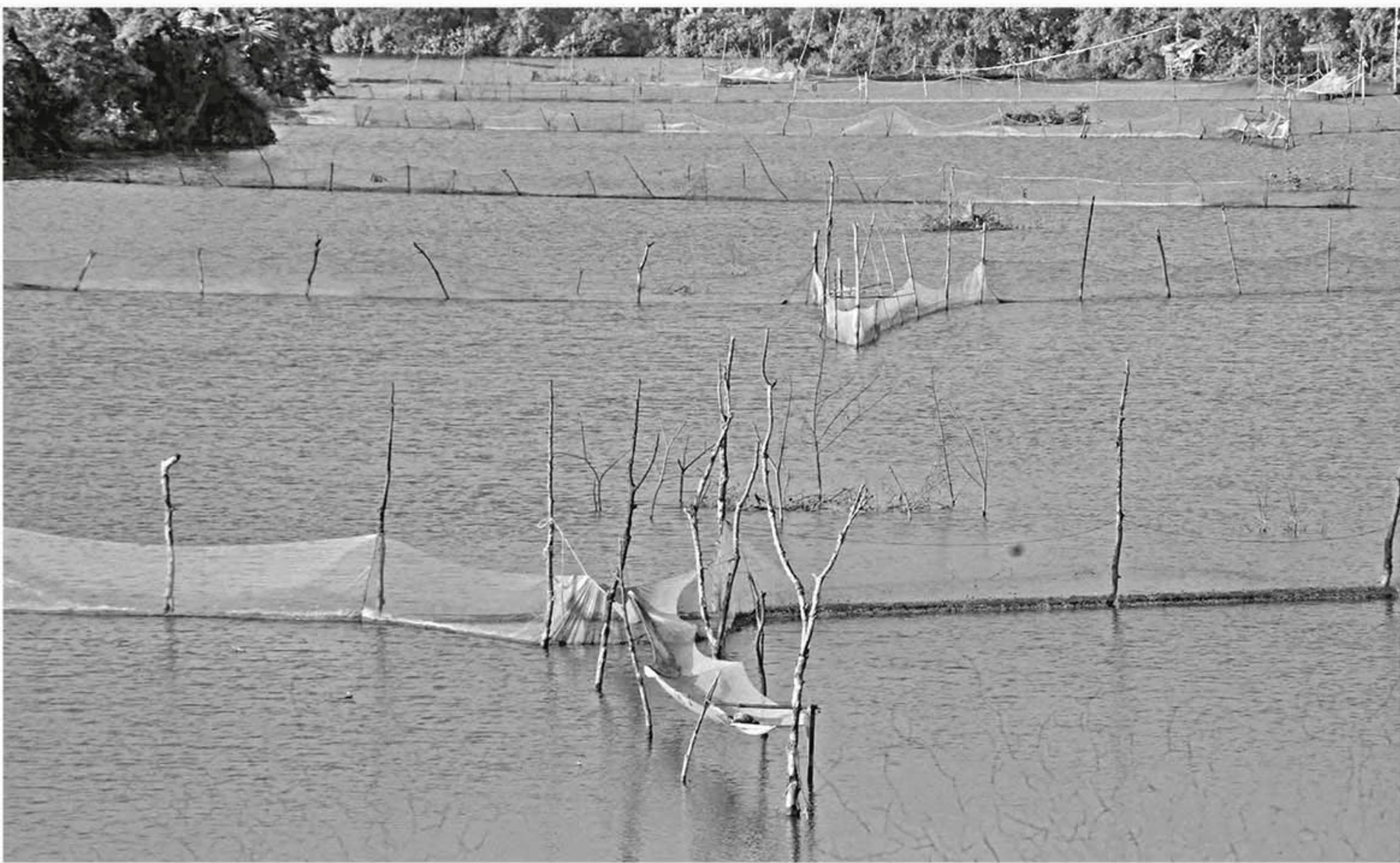
This recent photo shows only a few of over a thousand fishing nets placed across the entire width of Harinbaria canal in Taltali upazila of Barguna.