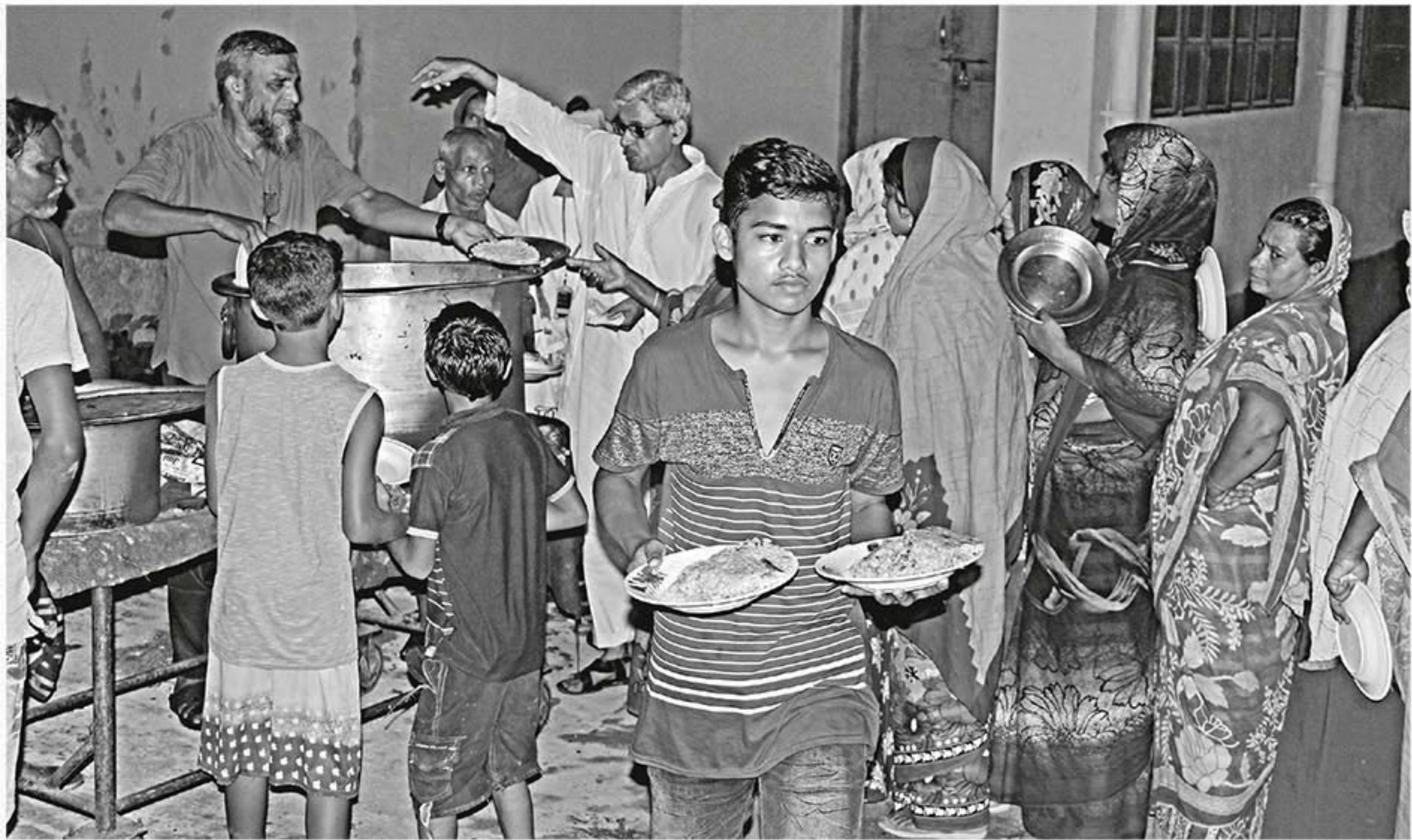
Patients and attendants collecting freshly cooked supper for just Tk 5 per head under the Mehman programme, initiated by a local voluntary group, at Chapainawabganj Adhunik Sadar Hospital.